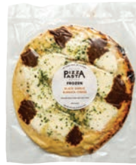
Katie's Pizza and Pasta Wood Fired Black Garlic Burrata Pizza SRP: $13 Booth: N519