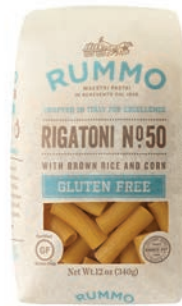
Rummo Pasta USA Gluten Free Rigatoni, No. 50 SRP: $4.49 Booth: 5547