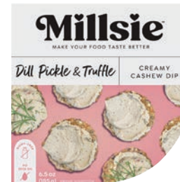
Millsie Fine Foods Dill Pickle Truffle Creamy Cashew Dip SRP: $7.99 Booth: 8218