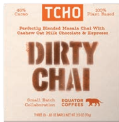
TCHO Chocolate Dirty Chai SRP: $9.99 Booth: 5020