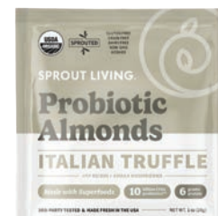
Sprout Living Italian Truffle Probiotic Almonds SRP: $29.95 / 10 pack Booth: N129