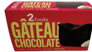
2foods Chocolate Gateau SRP: $15.95 Booth: 3098C