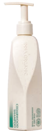
Inna Organic Cedarwood Shampoo SRP: $28.99 Booth: 2488