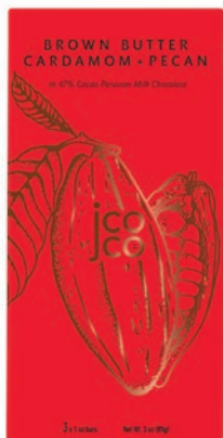
Seattle Chocolate Company joco Brown Butter Cardamom and Pecan Bar SRP: $10 Booth: N1844