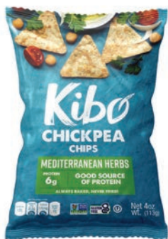
KIBO Foods Mediterranean Herb Chickpea Chips SRP: $5.49 Booth: N1040