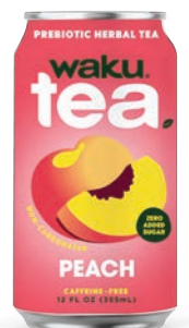
Waku Peach Prebiotic Herbal Tea SRP: $2.99