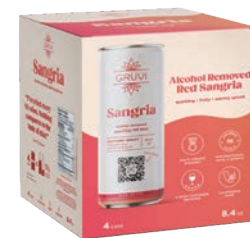
Gruvi Sangria SRP: $19.99 Booth: 7101