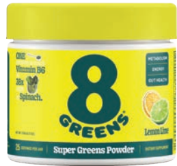
8 Greens Super Greens Powder SRP: $34.99 Booth: N2241