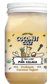
The Coconut Cult Pina Colada Probiotic Coconut Yogurt SRP: $17.99 Booth: 5488