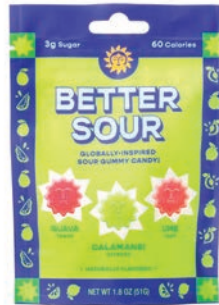
Better Sour Guava Calamansi Ume Sour Gummy Candy SRP: $3.99 Booth: N1235