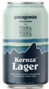
Patagonia Provisions Patagonia x Topa Topa Kernza Lager SRP: $12.99 / 6 pack Booth: N842