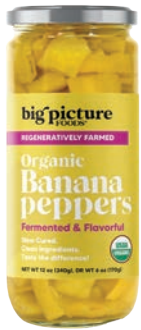
Big Picture Foods Fermented Banana Peppers SRP: $5.49 Booth: N221