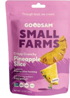
GoodSAM Foods Crispy Crunchy Pineapple Slice SRP: $4.99 Booth: N2204