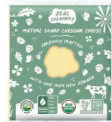
Zeal Creamery Mature Sharp Cheddar Cheese SRP: $8.49 Booth: 5150