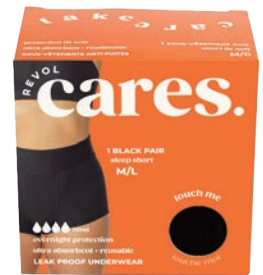
Revol Cares Essential Sleep Short SRP: $29.99 Booth: 3041