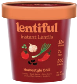
Lentiful Homestyle Chili Instant Lentils SRP: $4.95