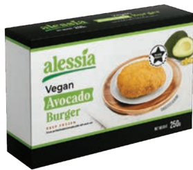
Alessia (Viru) Vegan Avocado Burger SRP: $6.50 Booth: 2998B