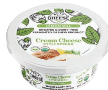
Nuts For Cheese Lemon Dill Cream Cheese Style Spread SRP: $7.99 Booth: 5357