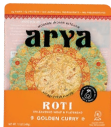
Arya International Golden Curry Roti SRP: $7.89 Booth: 4899A