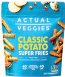
Actual Veggies Classic Potato Super Fries SRP: $5.99 Booth: 5252