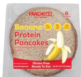
Crepini Pancheesi Banana Protein Pancakes SRP: $6.99 Booth: 499