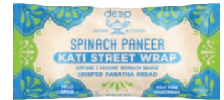
Deep Indian Kitchen Spinach Paneer Kati Street Wrap SRP: $4.39 Booth: 5445