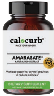
Calocurb Amarasate Natural Hops Extract SRP: $69.99