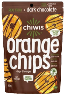
Chiwis Dark Chocolate Drizzled Orange Chips SRP: $6.99