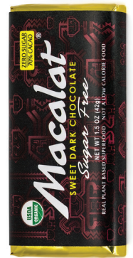
Macalat Sweet Dark Chocolate SRP: $4.99 Booth: N416