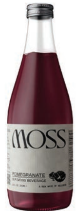
MOSS Pomegranate Sea Moss Beverage SRP: $4.99 Booth: 8204