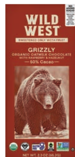
Wild West Grizzly Oatmilk Chocolate SRP: $5.99 Booth: N505