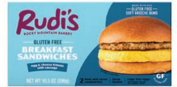
Rudi's Rocky Mountain Bakery Gluten Free Breakfast Sandwiches with Sausage SRP: $8.99 Booth: 5431