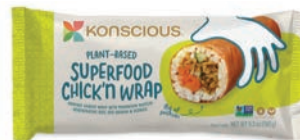
Konscious Foods Plant-Based Superfood Chick'n Wrap SRP: N/A Booth: 5679