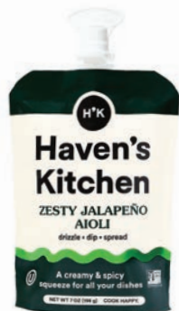
Haven's Kitchen Zesty Jalapeno Aioli SRP: $7.99 Booth: N1635