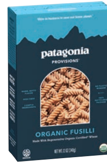
Patagonia Provisions Organic Fusilli SRP: $6.49 Booth: N842