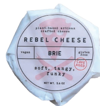
Rebel Cheese Cave Aged Brie SRP: $15