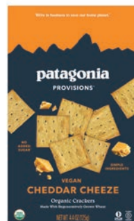
Patagonia Provisions Vegan Cheddar Cheeze Organic Crackers SRP: $6 Booth: N842