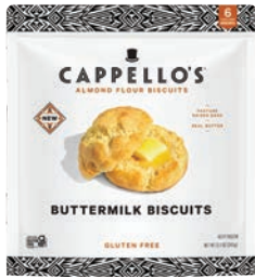
Cappello's Almond Flour Buttermilk Biscuits SRP: $8.99 Booth: 8605