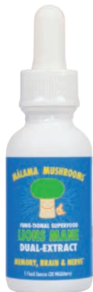
Malama Mushrooms Lion's Mane Dual-Extract Tincture SRP: $30 Booth: N2248