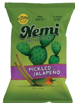
Nemi Snacks Pickled Jalapeño Cactus Sticks SRP: $3.99