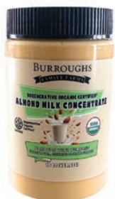
Burroughs Family Farms ROC-Almond Milk Concentrate SRP: $21.99 Booth: F69