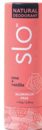
Slo Natural Beauty Rose and Vanilla Natural Deodorant SRP: $12.99