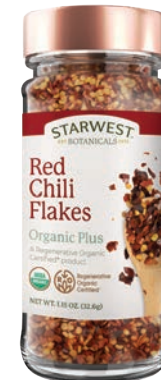
Starwest Botanicals ROC Red Chili Flakes SRP: $5.49 Booth: 1431