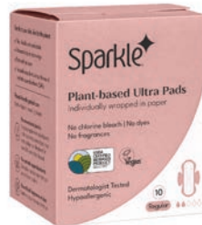
Sparkle Innovations Plant-Based Pads SRP: $5.80 Booth: 2684