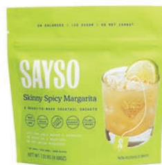
Sayso Skinny Spicy Margarita Cocktail Tea Bags SRP: $14.99 Booth: N1942