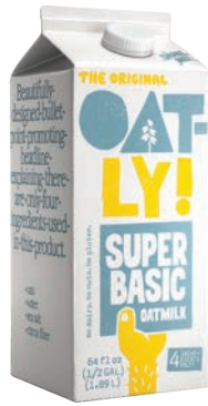
Oatly Super Basic Oatmilk SRP: $5.99 Booth: 604