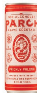
Parch Spirits Prickly Paloma Agave Cocktail SRP: $5 Booth: 7303