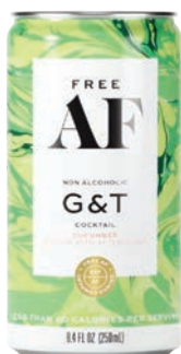
Free AF G & T SRP: $14.99