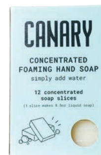
Canary Concentrated Hand Soap Refill Bar SRP: $15 Booth: 3057