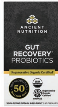
Ancient Nutrition Gut Recovery Probiotics SRP: $59.95 Booth: 3981