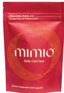
Mimio Health Daily Cell Care SRP: $100