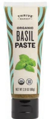
Thrive Market Organic Basil Paste SRP: $3.99