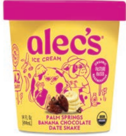
Alec's Ice Cream Palm Springs Banana Chocolate Date Shake SRP: $8.99 Booth: F92