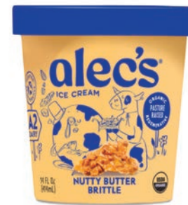
Alec's Ice Cream Nutty Butter Brittle SRP: $8.99 Booth: F92