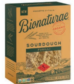
Jovial Foods Bionaturae Sourdough Pasta SRP: $3.49 Booth: 1951