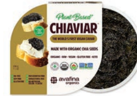
Avafina Organics Plant Based Chiaviar SRP: $6.99 Booth: 1504