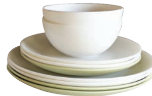
World Centric ZeroWare Bowl SRP: Varies