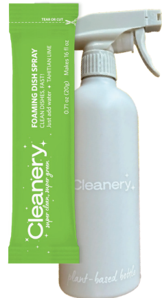
The Sustainable Care Company Cleanery Tahitian Lime Foaming Dish Spray SRP: $4.49 Booth: 2404