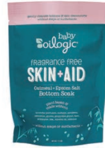
Oillogic Skin Aid Oatmeal and Epsom Salt Bottom Soak SRP: $7.99 Booth: 2908