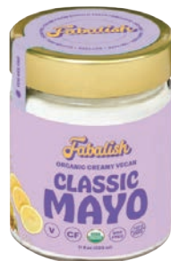
Fabalish Classic Mayo SRP: $9.99 Booth: 2006