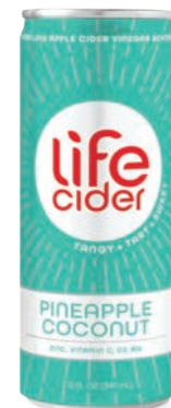
Life Cider Pineapple Coconut Sparkling Apple Cider Vinegar Beverage SRP: 3.79 Booth: 4497