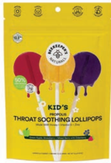
Beekeeper's Naturals Kid's Propolis Throat Soothing Lollipops SRP: $9.99 Booth: N1902