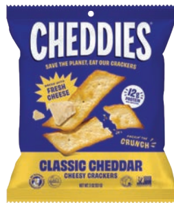
Cheddies Classic Cheddar Cheesy Crackers SRP: $2.89 Booth: N1438