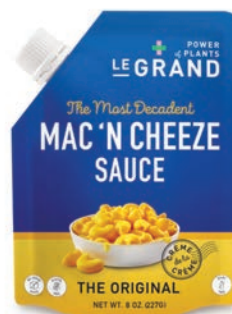
Le Grand Plant-Based Mac and Cheeze Sauce SRP: $7.99 Booth: 5598B