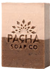
Pacha Soap Co Coconut and Rice Milk Bar Soap SRP: $6.99 Booth: 3017