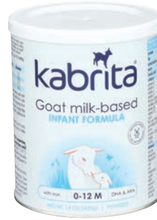
Kabrita Goat milk-based Infant Formula SRP: $27.99 Booth: N209