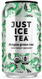
Eat the Change Just Ice Tea Dragon Green Tea SRP: $2.19 Booth: N934