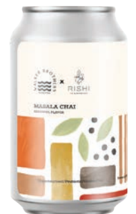
Walker Brothers x Rishi Botanicals Masala Chai Kombucha SRP: $3.99 Booth: 8822