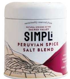
SIMPLI Peruvian Herb Salt Blend SRP: $9.99 Booth: N2239