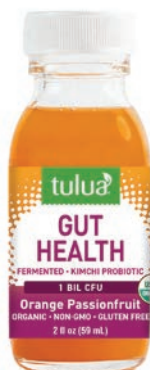
Tulua Gut Health Fermented Kimchi Probiotic Shot SRP: $4.39