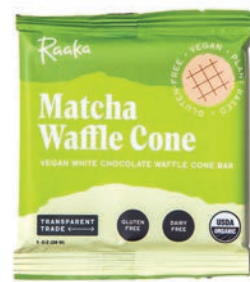
Raaka Chocolate Matcha Waffle Cone SRP: $5 Booth: 5671