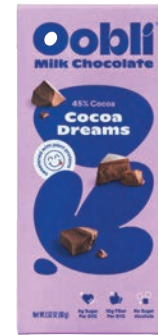
Oobli Milk Chocolate Cocoa Dreams SRP: $22.99/4-pack Booth: 4882