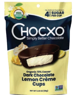
Chocxo Chocolatier Dark Chocolate Lemon Creme Cups SRP: $6.99 Booths: N828, 1705