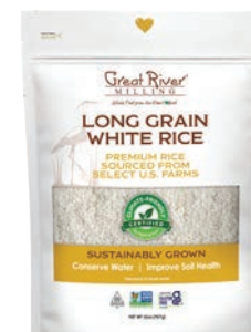
Great River Organic Milling Long Grain White Rice SRP: $3.99 Booth: 4790