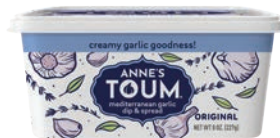
Anne's Toum Original Mediterranean Garlic Dip and Spread SRP: $6.99 Booth: 8613