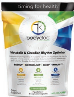
Bodycloc Naturals Bodycloc SRP: $24.98