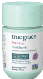
True Grace Prenatal Multivitamin SRP: $45.95 Booth: 4474