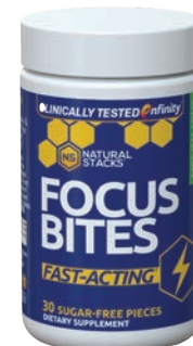
Natural Stacks Focus Bites SRP: $19.95 Booths: N2226, 3371