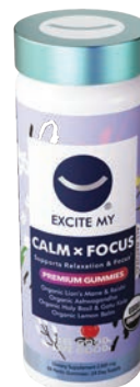
EXCITE MY Calm and Focus Journey Wellness Gummies SRP: $39.99 Booth: 7824