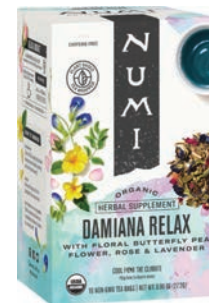
Numi Organic Tea Damiana Relax SRP: $7.99 Booth: F62