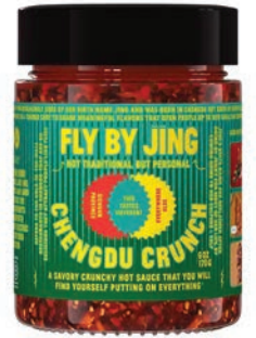
Fly By Jing Chengdu Crunch SRP: $17 Booth: N841