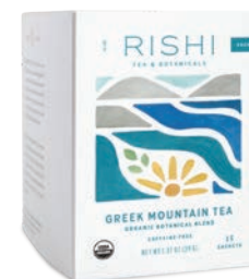
Rishi Tea & Botanicals Greek Mountain Tea SRP: $9.99 Booth: N1718