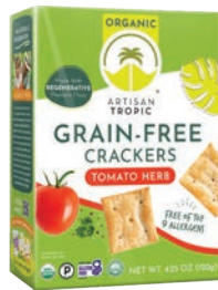
Artisan Tropic Tomato Herb Grain-Free Crackers SRP: $5.39 Booth: N2342