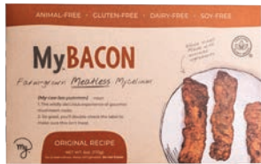
MyForest Foods MyBacon SRP: $8.99 Booth: N1123