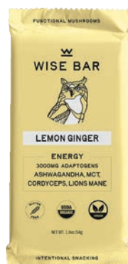
Wise Bar Lemon Ginger Energy Adaptogen Bar SRP: $2.99 Booth: N2109