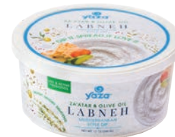
Yaza Foods Za'atar and Olive Oil Labneh SRP: $6.49 Booth: 2599B