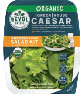
Revol Greens (Green)House Organic Caesar Salad Kit SRP: $4.99