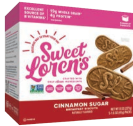
Sweet Loren's Cinnamon Sugar Breakfast Biscuits SRP: $6.99 Booth: 5589