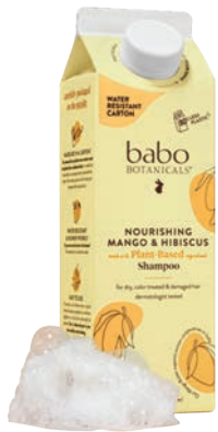
Babo Botanicals Mango and Hibiscus Shampoo SRP: $18.5 Booth: 2722