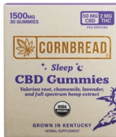
Cornbread Hemp Sleep CBD Gummies, 1500mg SRP: $74.99 Booth: 3058