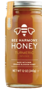
Bee Harmony Honey Turmeric Infused Honey SRP: $12.99 Booth: N2024