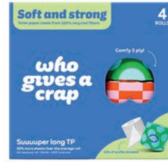
Who Gives A Crap Premium 100% recycled Toilet Paper SRP: $6.99 Booth: 2932