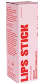
Medicine Mama Lips Stick VMagic On-the-go SRP: $19.99