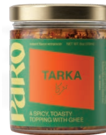
Paro Tarka SRP: $16