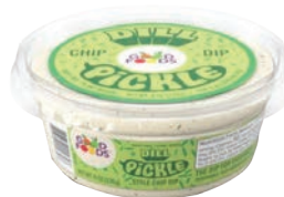
Good Foods Group Dill Pickle Chip Dip SRP: $4.49