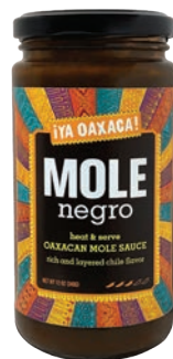
Ya Oaxaca Mole Negro SRP: $6.99 Booth: 4950