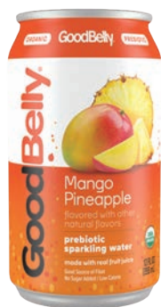
Good Belly Mango Pineapple Prebiotic Sparkling Water SRP: $1.98 Booth: N722