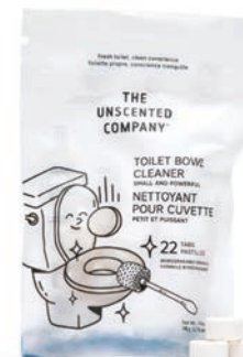
The Unscented Company Toilet Bowl Cleaner SRP: $12.99 Booth: N1537