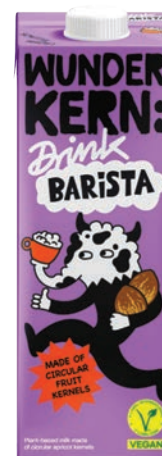
Kern Tec Wunderkern Circular Apricot Seed Milk SRP: $2.99 Booth: 180