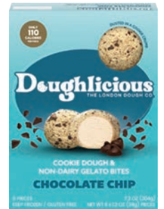
Doughlicious The London Dough Co. Chocolate Chip Cookie Dough and Gelato Bites SRP: $6.99 Booth: 1899A