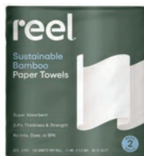
Reel Bamboo Paper Towels SRP: $16.99 Booth: 3047