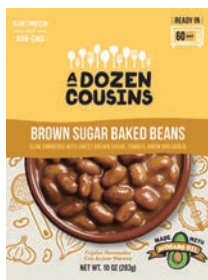
A Dozen Cousins Brown Sugar Baked Beans SRP: $3.99 Booth: N213