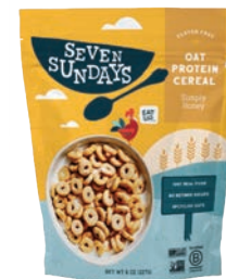
Seven Sundays Simply Honey Oat Protein Cereal SRP: $7.99 Booth: N1330