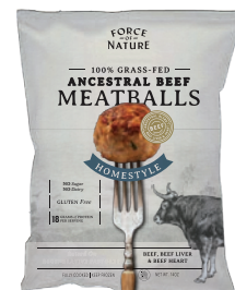
Force of Nature Ancestral Beef Homestyle Meatballs SRP: $12.99 Booths: N347, 4451