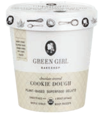
Green Girl Bakeshop Chocolate Covered Cookie Dough Gelato SRP: $8.99 Booth: N2320