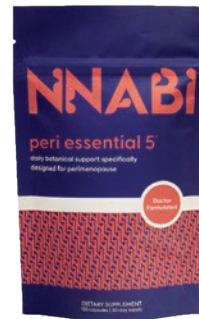
NNABI Peri Essential 5 SRP: $125