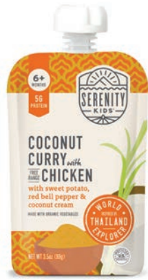
Serenity Kids Coconut Curry with Free Range Chicken SRP: $3.99 Booth: N126