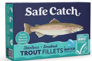
Safe Catch Smoked Trout Fillets in Water SRP: $6.99-7.99 Booth: 5212