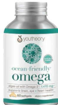
Youtheory Ocean-Friendly Omega SRP: $23.99 Booth: 3863