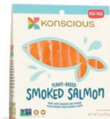
Konscious Foods Plant-Based Smoked Salmon SRP: $5.99 Booth: 5679