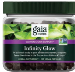
Gaia Herbs Infinity Glow SRP: $42.99 Booth: 3843