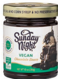
Sunday Night Foods Vegan Chocolate Sauce SRP: $8.99 Booth: 200