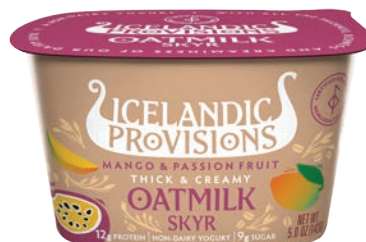
Icelandic Provisions Mango and Passion Fruit Oatmilk Skyr SRP: $2.49 Booth: 5644