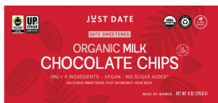
Just Date Organic Date Sweetened Milk Chocolate Chips SRP: $9.99