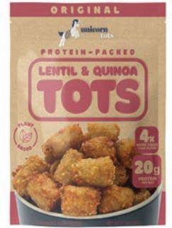
Unicorn Tots Lentil and Quinoa Tots SRP: $6.99 Booth: 8504