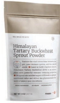
Big Bold Health Himalayan Tartary Buckwheat Sprout Powder SRP: $45