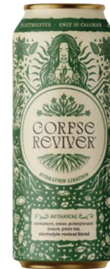
Hooch Booch Botanical Corpse Reviver SRP: $3.49