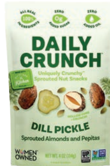
Daily Crunch Dill Pickle Sprouted Almonds and Pepitas SRP: $6.99 Booth: N2112