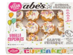
Abe's Vegan Muffins Vanilla Mini Cupcakes SRP: $7.99 Booth: N845