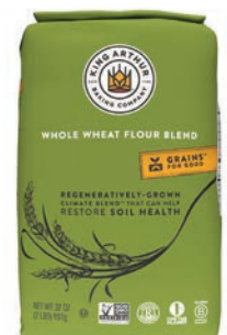
King Arthur Baking Company Regeneratively-Grown Climate Blend Whole Wheat Flour SRP: $5.99 Booths: 5185, 890