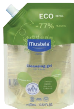
Mustela Eco-Refill Organic Cleansing Gel SRP: $17.5 Booth: 2722