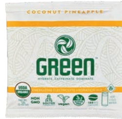
GREEN Coconut Pineapple Energizing Electrolyte Hydration Mix SRP: $2.59