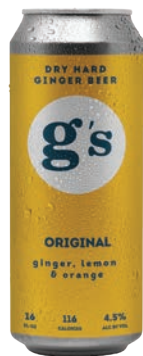
G's Dry Hard Ginger Beer G's Original Ginger, Lemon and Orange SRP: $4.49