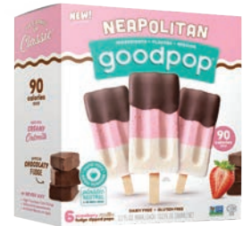
GoodPop Neapolitan Pops SRP: $8.99 Booth: 5015