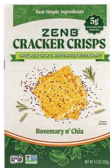
ZENB Rosemary n' Chia Cracker Crisps SRP: $5.99 Booth: N1740