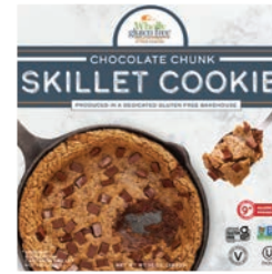
Wholly Wholesome Wholly Gluten Free Skillet Cookie SRP: $6.49 Booth: 5415