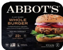
Abbot's Whole Burger SRP: $7.99 Booth: 5297