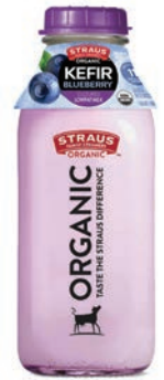
Straus Family Creamery Organic Lowfat Blueberry Kefir SRP: $6.99 Booth: F111