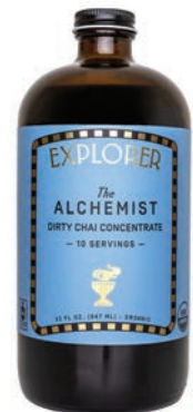
Explorer Cold Brew Alchemist Dirty Chai Concentrate SRP: $19.99 Booth: 8711