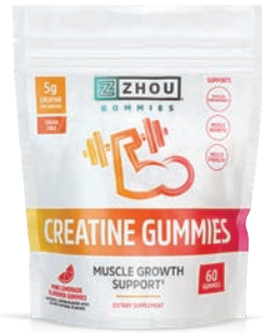
Better Being Co. Zhou Nutrition Creatine Gummies SRP: $34.99 Booth: 2605