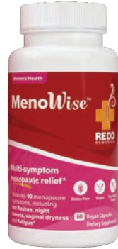
Redd Remedies Menowise SRP: $38.99