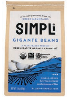
SIMPLi Gigante Beans SRP: $8.99 Booth: N2239