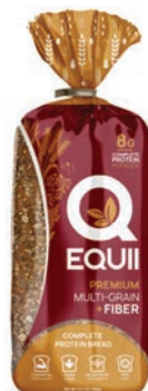
EQUI Protein and Fiber Bread SRP: $7.99 Booth: 4596