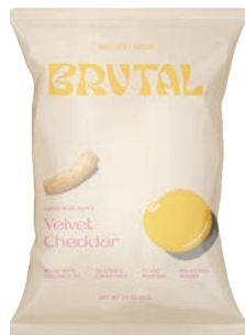
BRUTAL Velvet Cheddar Lupini Bean Puffs SRP: $5.50 Booth: N2309