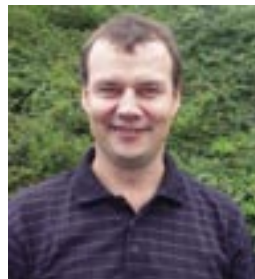
Head of Protein Separation at Novo Nordisk (Denmark)