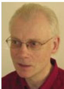
Technical Marketing Manager for Millipore Corporation (United Kingdom)