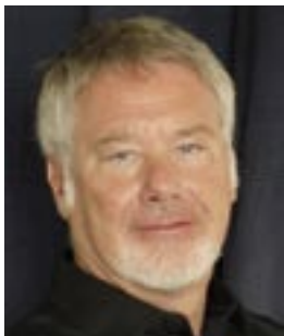
Chief Technology Officer in SVP Technical Development at Biogen Idec Inc. (USA)