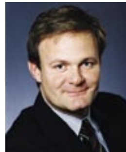
Director of Global Pathogen Safety for Baxter Bioscience (Austria)