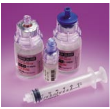
Top: Needleless transfer devices enable rapid transfer of a diluent into vacuum powder vials; Воттом: Vial adapters are a cost-effective way to reconstitute drugs between vials.

under- or overdose because the diluent may not be measured precisely. What's more, pharmaceutical manufacturers usually overfill vials by as much as 35% to ensure a sufficient quantity of a reconstituted drug for a correct dose. The overfill compensates for the inherent variability of the manual process as well as the difficulty of removing liquid completely from a vial.