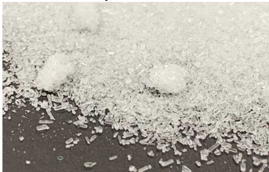
Conventional tris crystal structure