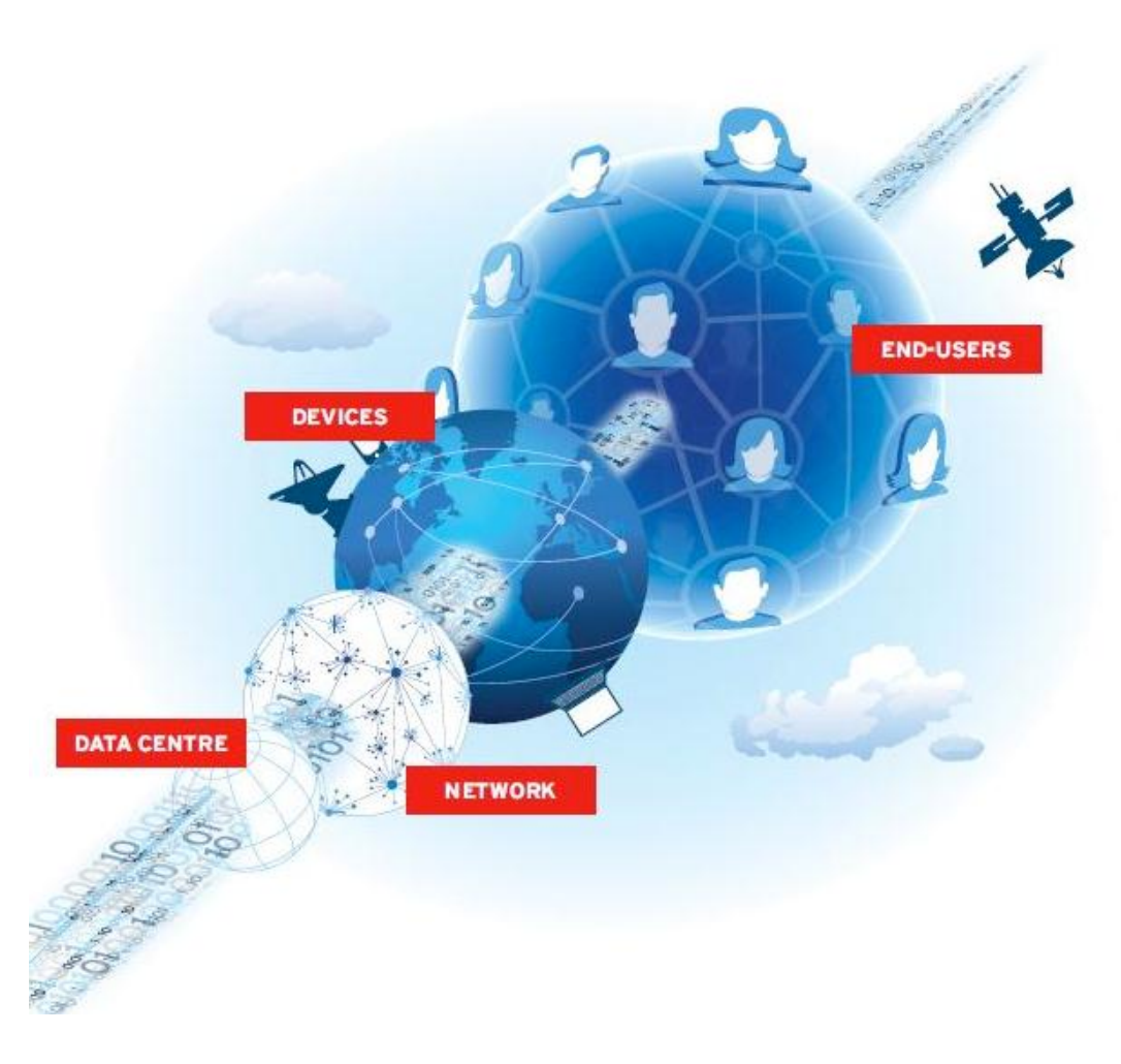
Figure 4 – The four levels of Cloud security