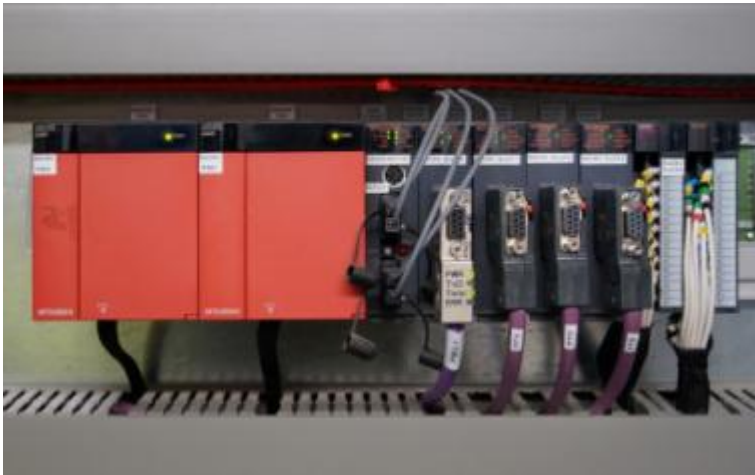
Picture 2: The relative transparency of the system means that networks and communications issues right down to the I/O point for any component can be identified and any issues addressed quickly.