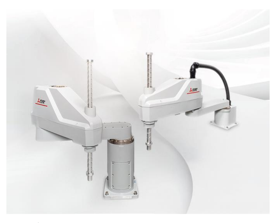
Image: Left: MELFA RH-20CRH, Right: MELFA RH-10CRH. These new robots provide manufacturers with greater flexibility in adopting digital manufacturing while addressing skilled workforce shortages.

Mitsubishi Electric has launched its MELFA RH-10CRH and RH-20CRH SCARA robots, providing manufacturers with greater flexibility in adopting digital manufacturing while addressing skilled workforce shortages. These new robots enhance industrial automation through high-speed operation, easy installation, and exceptional efficiency. Compact and lightweight, they are ideal for manufacturers aiming to boost productivity while navigating space and weight constraints.