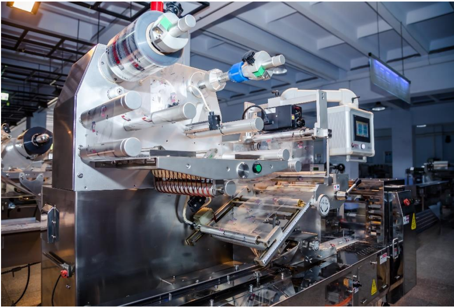
Figure 1: Golden Pak’s packaging equipment is exported to more than 60 countries and regions including the United States, Germany, Japan and Russia.