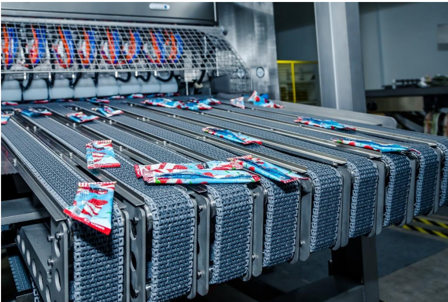
Figure 2: With the support of Mitsubishi Electric and Qingdao Keling, Golden Pak developed and upgraded special equipment for horizontal feeding, organizing, packaging, sorting and palletizing for many industries such as food and medicine.