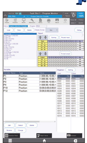
▲ Program monitor