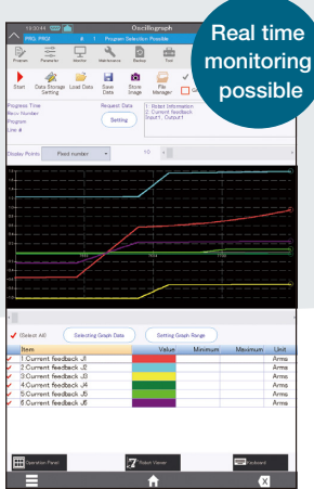
▲ Oscillograph function

Various types of displays and analysis screens make it possible to perform trouble diagnosis and achieve early troubleshooting without a computer.