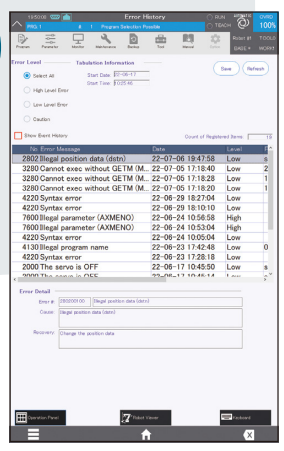
▲ Error history