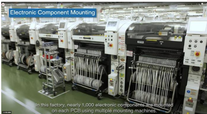
Figure 3: The first tour will show how Mitsubishi Electric’s factory automation (FA) controller products are made at its Nagoya Works.