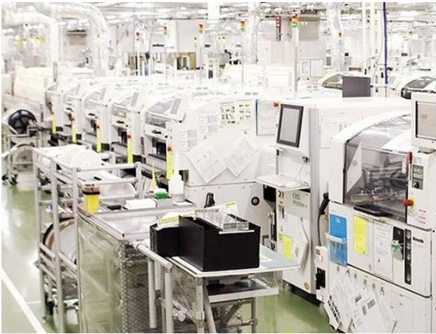
Figure 1: Mitsubishi Electric's Virtual Factory Tour, now available through online videos, will walk you through the various technologies and solutions behind the manufacture of its FA products.