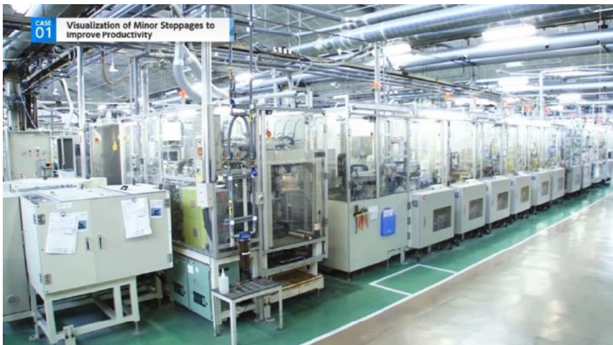
Figure 4: The second factory tour will introduce the production lines at Mitsubishi Electric’s Fukuyama Works, which utilize the integrated FA-IT solution “e-F@ctory” to achieve digital manufacturing.