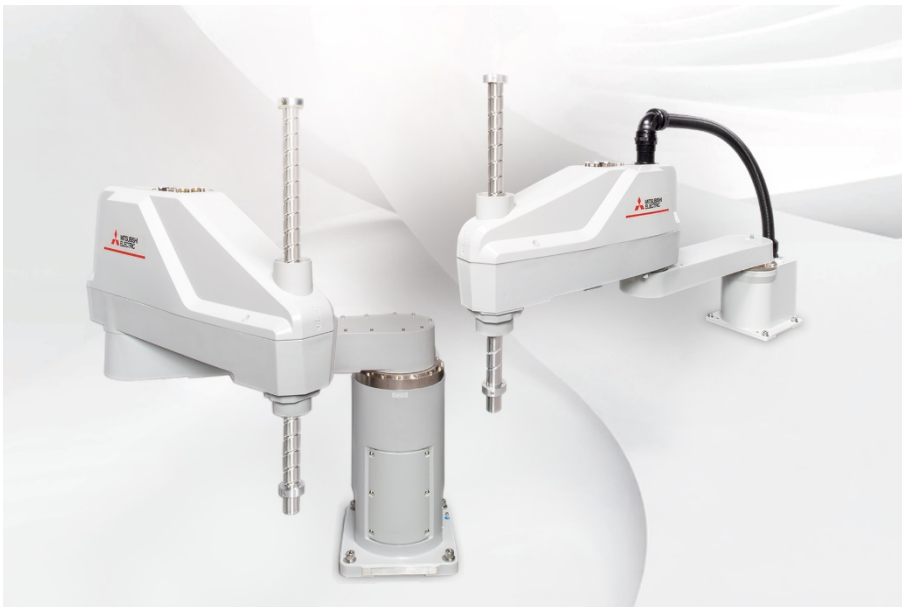
Image: Left: MELFA RH-20CRH, Right: MELFA RH-10CRH. These new robots provide manufacturers with greater flexibility in adopting digital manufacturing while addressing skilled workforce shortages.

Mitsubishi Electric has launched its MELFA RH-10CRH and RH-20CRH SCARA robots, providing manufacturers with greater flexibility in adopting digital manufacturing while addressing skilled workforce shortages. These new robots enhance industrial automation through high-speed operation, easy installation, and exceptional efficiency. Compact and lightweight, they are ideal for manufacturers aiming to boost productivity while navigating space and weight constraints.