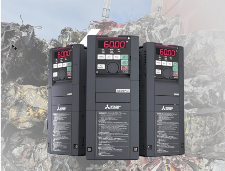
Image 8: With the help of modern drive technology from Mitsubishi Electric, an impressive return on investment (ROI) can be achieved through cost savings and increased productivity.