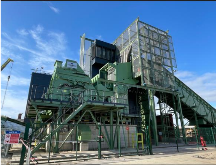
Image 2: Existing systems can easily be retrofitted with Mitsubishi Electric's low-maintenance frequency inverters on three-phase asynchronous motors, which leads to savings in energy, wear and maintenance costs.