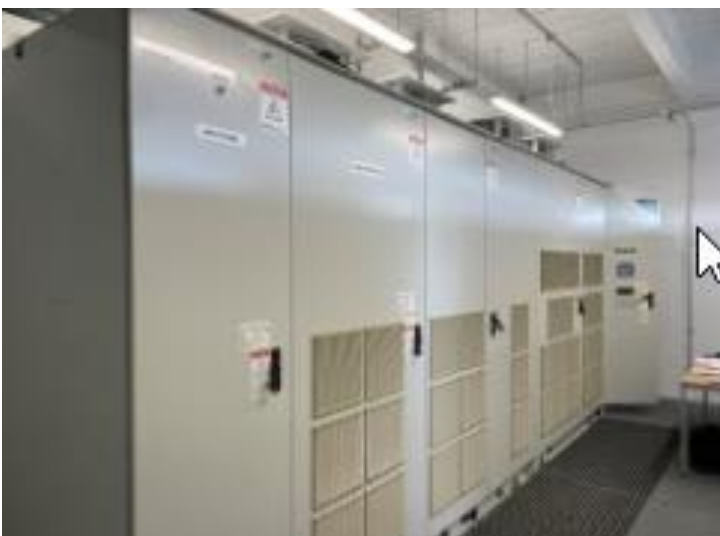
Image 3: The flexible control provided by the Mitsubishi Electric's TMdrive or the frequency inverter FR-A800/FR-F800 series enables higher motor