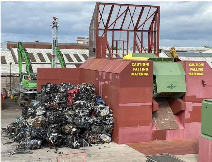
Image 9: The EtaRip Pre-shredder is the preliminary stage of the Zerditor shredder, which effortlessly recycles 130 tons of metal per hour – from scrap metal to entire end of life vehicles.