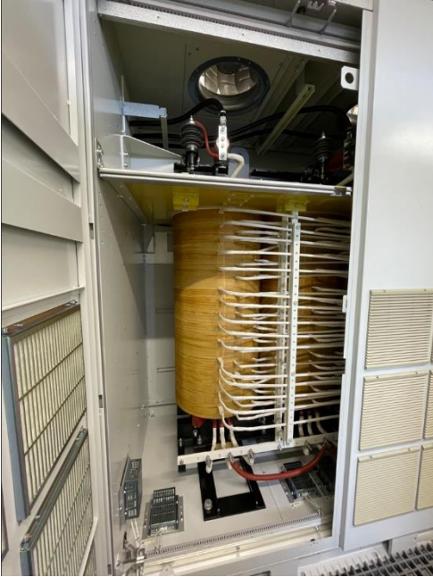
Image 6: The transformer ensures the power supply for the drive units.