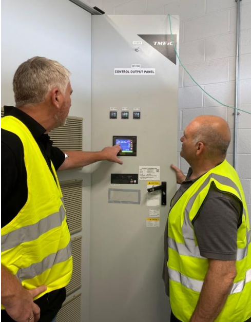
Image 4 : Operating data is visualized in a user-friendly way via the GOT operator terminal from Mitsubishi Electric.