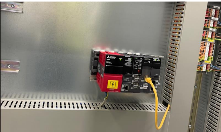
Image 7: The MELSEC I-QR series controller provides the operating data for the Asset Portal via the RD55 data logger.