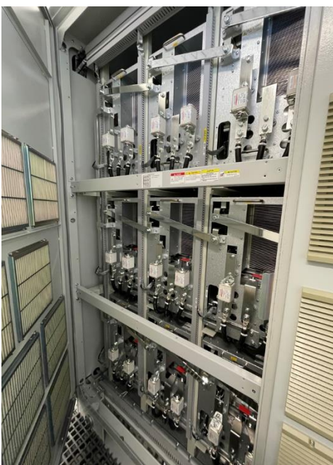
Image 5 : The drive units form the centerpiece and the power section of