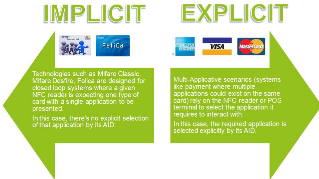
Figure 3: Examples of Implicit and Explicit AID applications in NFC

Aside from transport applications such as MIFARE or Felica most NFC applications are addressed by their AID. Until Android 4.4 was introduced with HCE, all NFC applications on the SE could communicate using contactless technology, since the contactless front-end (CLF), which acts as a gateway between the NFC antenna and the SE, would forward all communication to the SE directly without any host OS intervention.