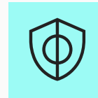
Sec Ops Engineers