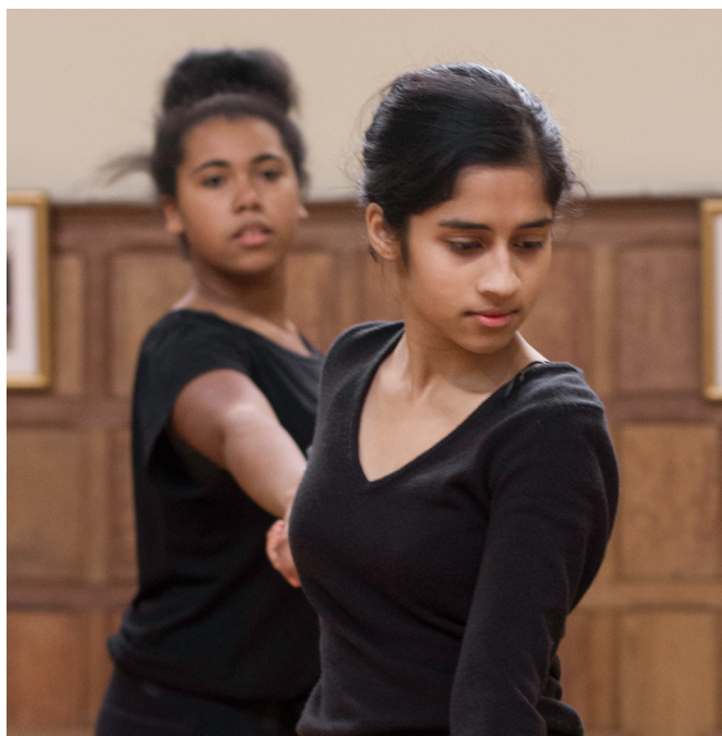
Old Palace