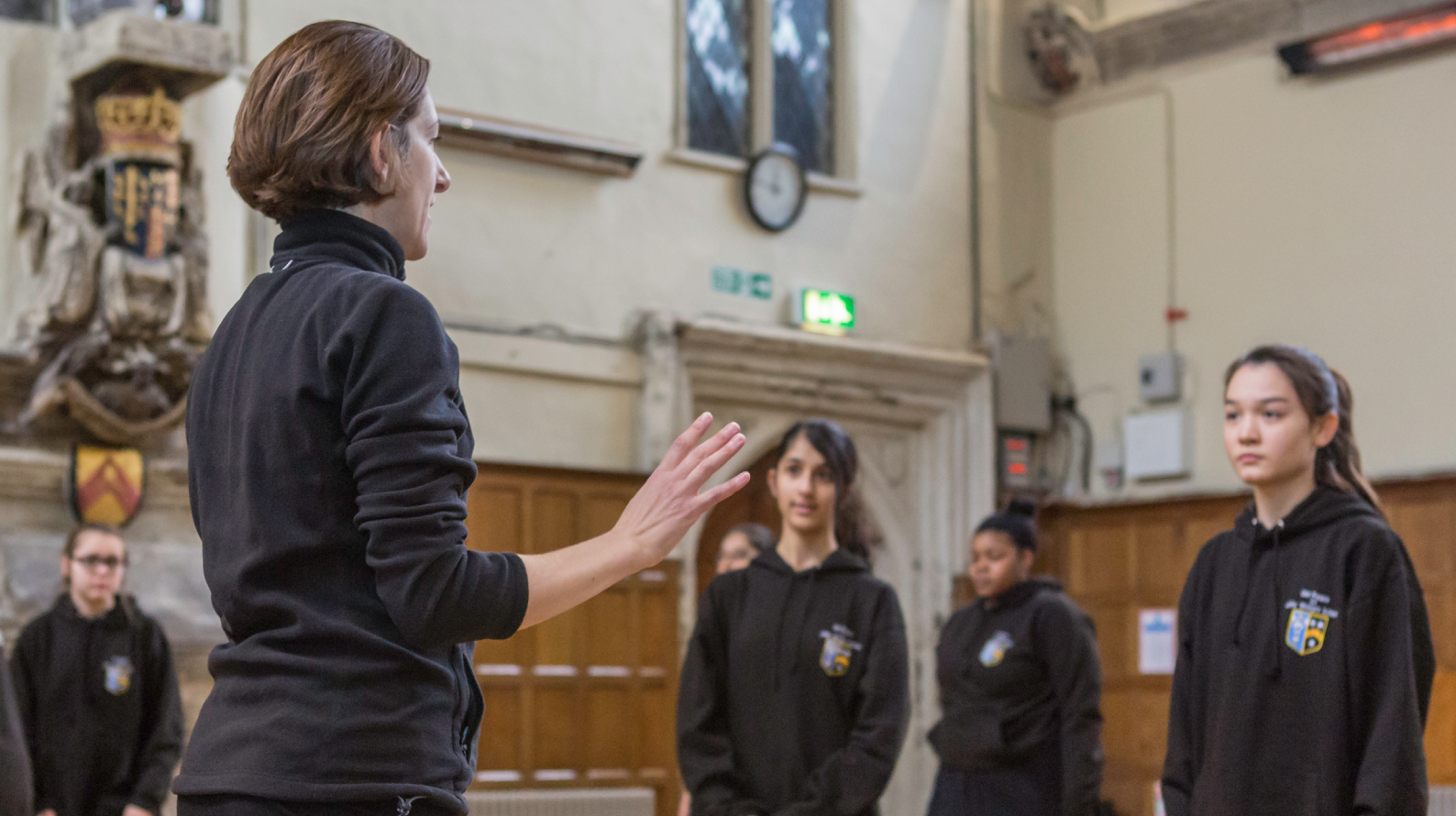
Old Palace