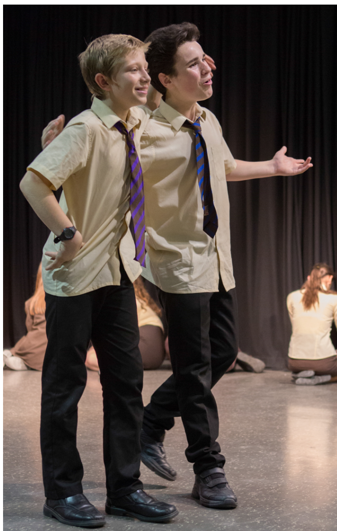
Bishop Ramsey CE Academy

theatrical staging, language and practice, and demonstrate their learning and understanding through their reviews of dramatic performances. By looking at the context surrounding any performance, students help to develop their knowledge of how this can influence a text, its presentation and reception.