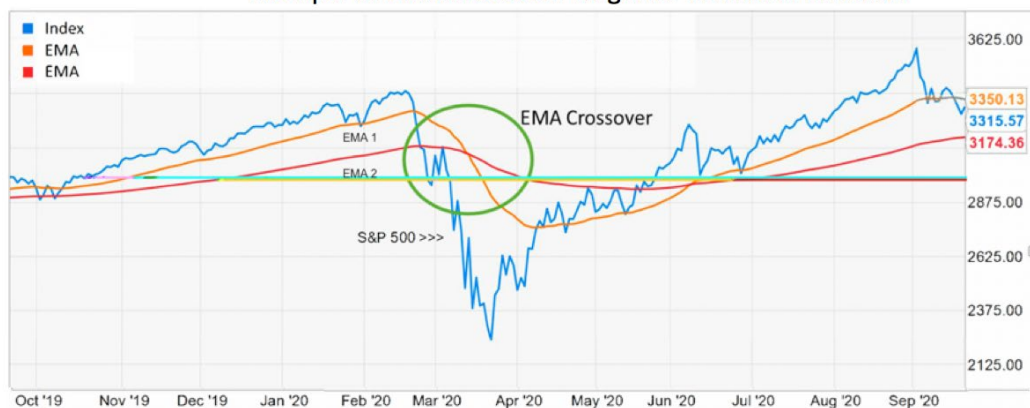
Example of EMA Crossover Negative Technical Indicator

Primary Technical Indicators – The VCM Tactical Overlay measures two proprietary EMA's of the S&P 500 closing prices to determine inflection points. When these two moving averages cross, the trend indicators signal a risk-on or risk-off position accordingly. Multiple market scenarios were tested utilizing a long time period to determine the optimal technical indicators. We observed that this methodology provides advantageous trigger points that can avoid material downside losses while participating in a portion of upside gains.