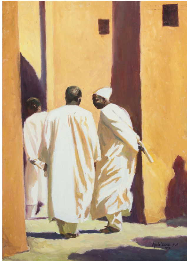
Samuel Ajobiewe , Scholars , Oil on canvas, 41.5 x 28 inches, 2002