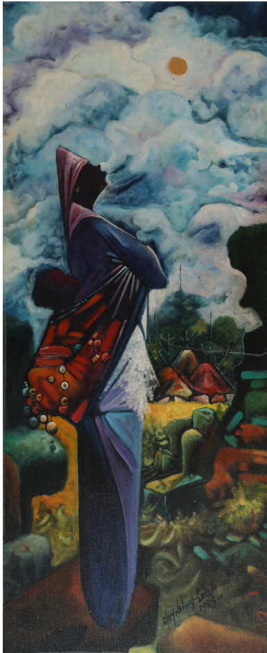
Clary Nelson-Cole , Mother and child, Oil on board, 33 x 14 inches, 1989