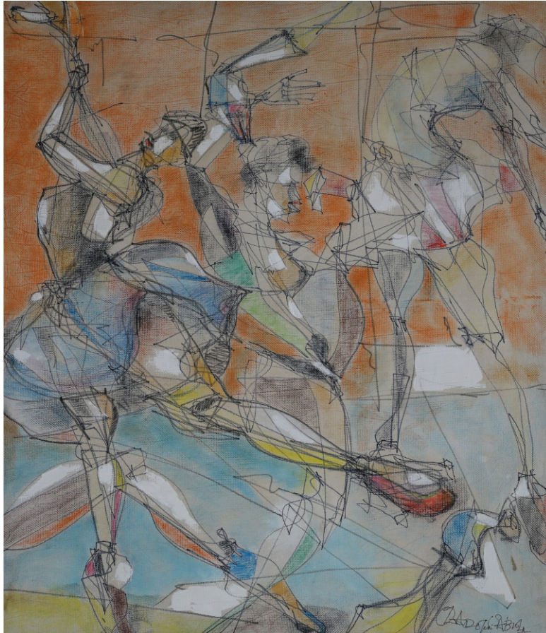
Oladotun Abiola, N_A, Acrylic on canvas, 46 x 55 inches, 2017