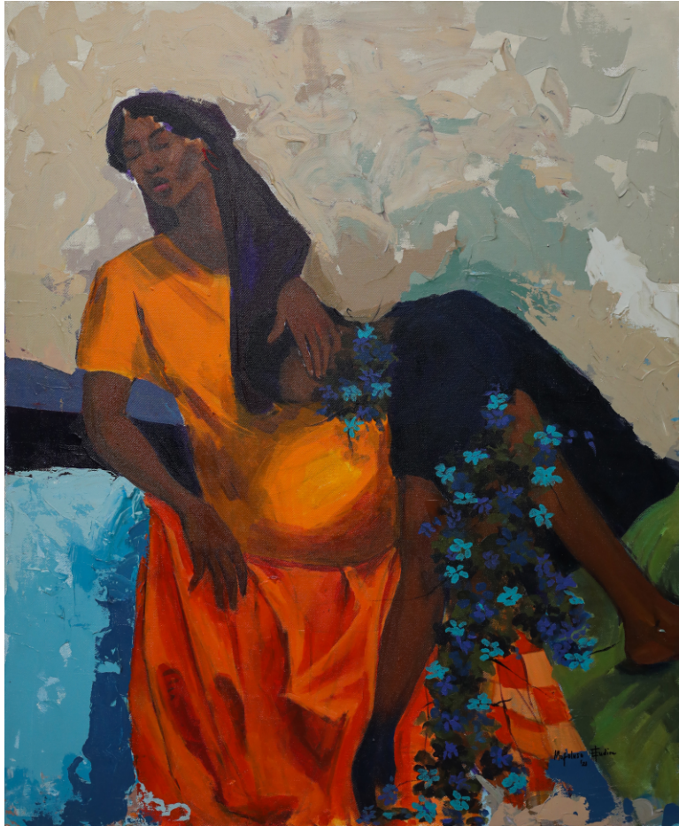
Mofoluso Eludire , Takes Two, Acrylic on canvas, 36 x 44 inches, 2021