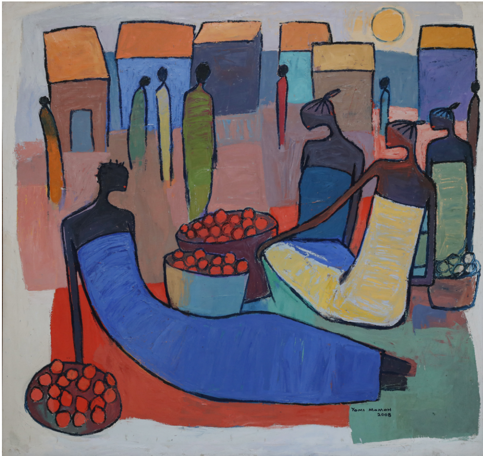
Yomi Momoh , The tomato sellers (kaduna), Acrylic on canvas, 43.5 x 45.5 inches, 2008