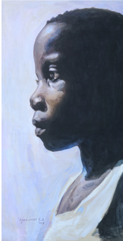
Samuel Ajobiewe , Untitled, Acrylic on canvas, 72.7 x 38.5 inches, 2015