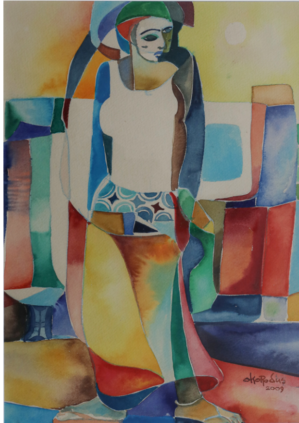
Godfrey Williams-Okorodus , Untitled, Watercolor on paper, 15 x 10.5 Inches, 2009