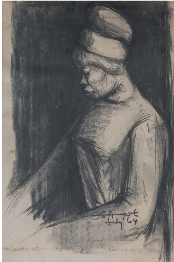
Ben Osawe , Untitled, pencil on paper, 14 x 21 inches, 1964