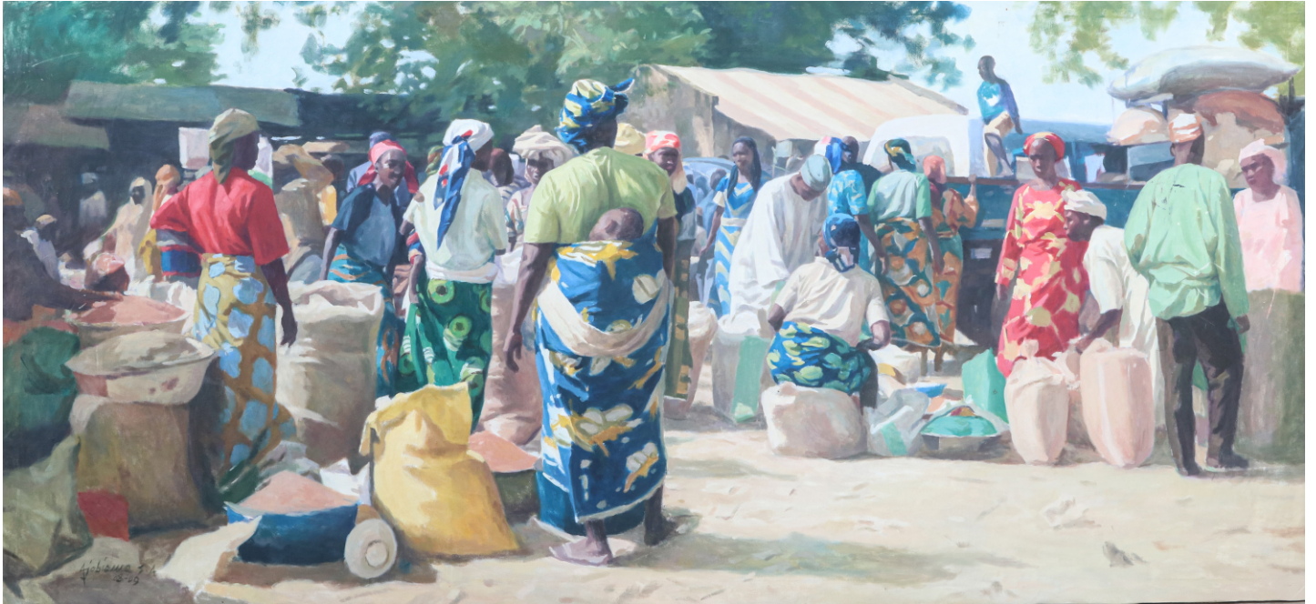
Samuel Ajobiwe , Untitled, Oil on canvas, 40 x 88.5 inches, 2009