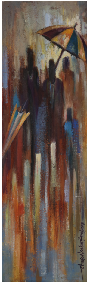
Chuka Nnabuife , It rains 1, Acrylic on canvas, 11.5 x 35.5 Inches, 2007