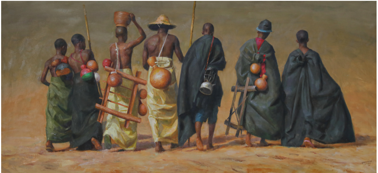
Ebenezer Akinola , A hundred miles on foot, Oil on canvas, 22.8 x 49 inches, 2020