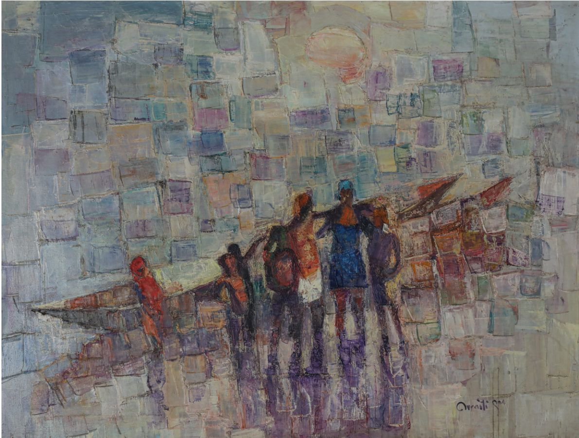
Sam Ovrati , Untitled, Oil on canvas, 33 x 43 inches, 2004