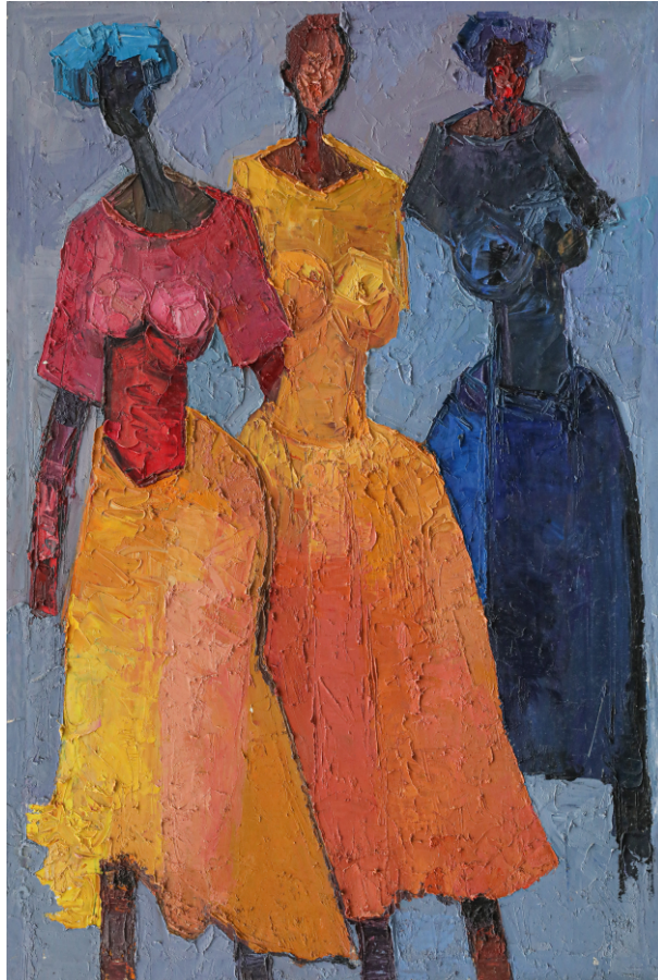
Duke Asidere , Space person, Oil on canvas, 40 x 60 inches, 2019