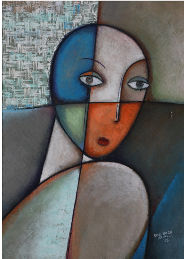
Ebenezer Akinola , Innocence ii, Oil on canvas, 22 x 16 inches, 2008