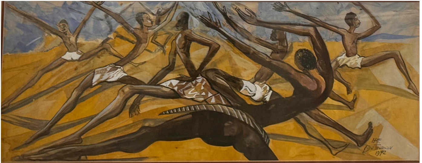
Ben Enwonwu, N_A, Acrylic on paper, 25 x 10 inches, 1972