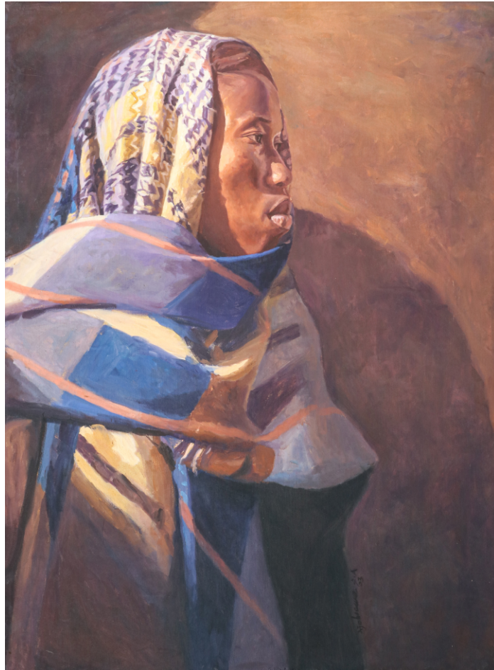
Samuel Ajobiewe , Untitled, Oil on canvas, 57.5 x 43 inches, 2003