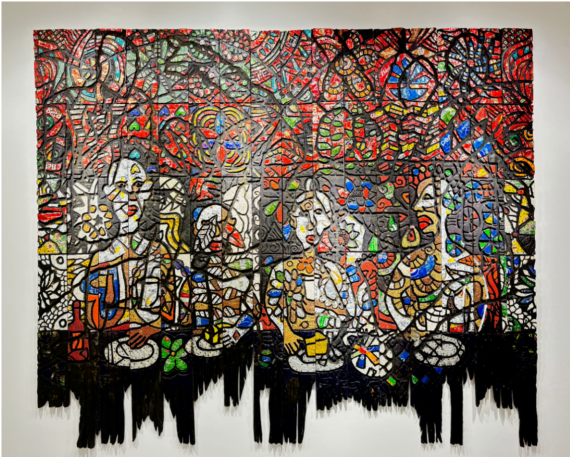
Gerald Chukwuma , The last supper, Mixed media, 80 x 66 inches, N_A