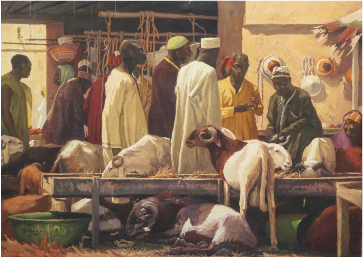
Samuel Ajobiewe , The bargain , Oil on canvas, 40.75 x 58 inches, 2001