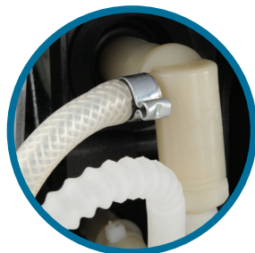
Between Pump and Distributor