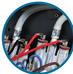
Between Distributor and Heater