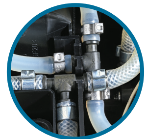
Between Heater and Brewer