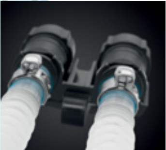
Fuel & Oil Lines StepLess® Ear Clamps