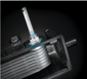
Heating/Cooling Systems Quick Connectors