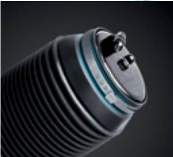
Air Suspension StepLess® Ear Clamps