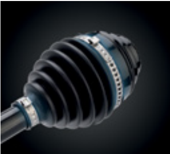
Driveshaft/Steering DualHook Adjustable Ear Clamps