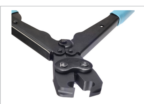
Hand Installation Pincer for Ear Clamps HIP 7000 | 425