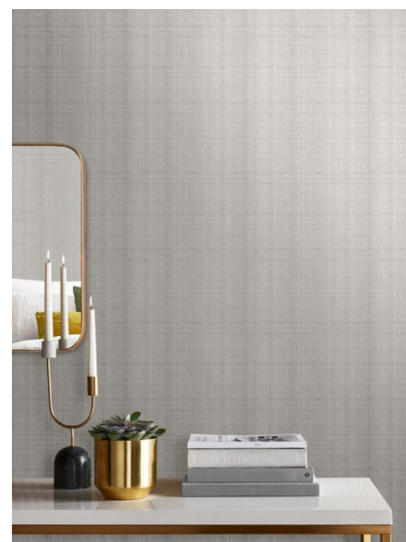
PAPER Haze Natural grahambrown.com

The perfect blend between grey and neutral, WARM MITTENS will keep you cosy this Christmas.