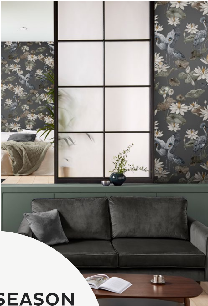
Teien Slate Grey Wallpaper as seen in REAL HOMES

We like nothing more than leafing through the top interior press magazines and being inspired by their schemes and gorgeous imagery!