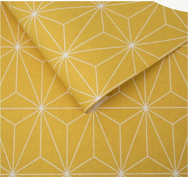
Prism Yellow Wallpaper