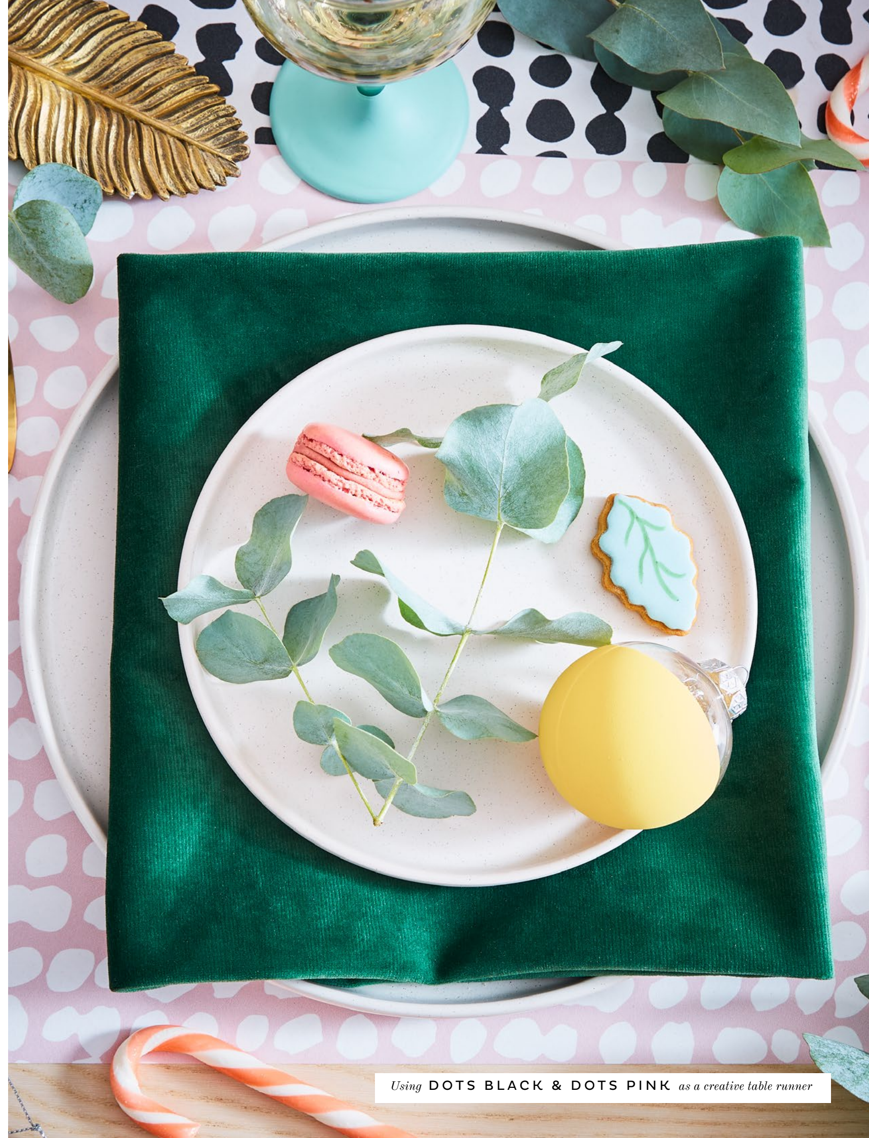
Using DOTS BLACK & DOTS PINK as a creative table runner

The expressive design style is a celebration of unique objects, bold colours, striking shapes, and surprising elements. We make the most of this scheme by using separate combinations of different materials and mixed styles, from hip, unique, and retro to Scandinavian and trendy. In short, a design and interior that excites the imagination. These are the hallmarks of an expressive design style, to be free to let creativity run wild and design an interior that reflects each individual personality.