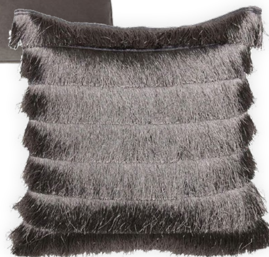
Grey Luxe & Gatsby Grey Fringed grahambrown.com