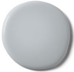
Luxe (Exterior Eggshell) as seen in MODERN GARDENS

Did you spot these pattern and colours from our product range?