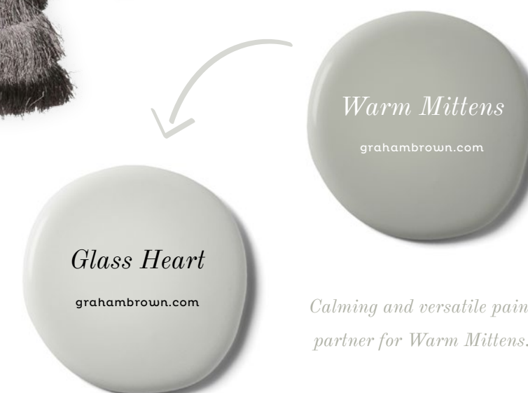
Warm Mittens grahambrown.com