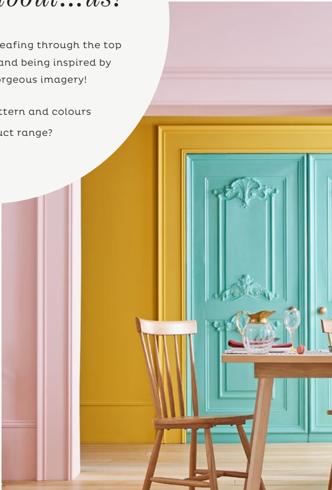
August, Tuscan Sunshine and Potion Paint as seen in THE TIMES