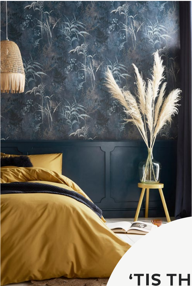
Restore Midnight Wallpaper as seen in THE SPRUCE US