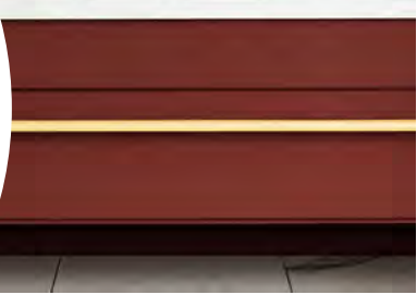
ANIMAHAL ALIZARIN WALLPAPER COTEMAISON.FR