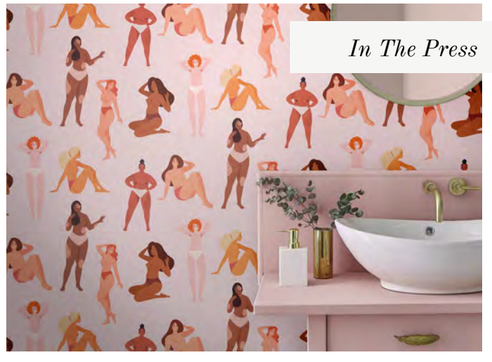
SIMPLY THE BREAST WALLPAPER METRO