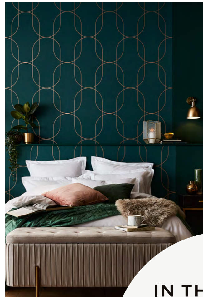
PALAIS GREEN WALLPAPER as seen in AD PRO