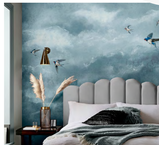
FLIGHTS OF SWALLOWS BESPOKE MURAL as seen in WONEN.NL