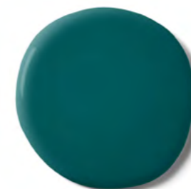
TASMANIA as seen in LE JOURNAL LA MAISON

We especially love to see some of the beautiful designs and colours from our product range, designed in our very own in-house studio!