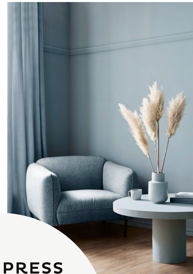
BREATHE PAINT as seen in HOUSE BEAUTIFUL