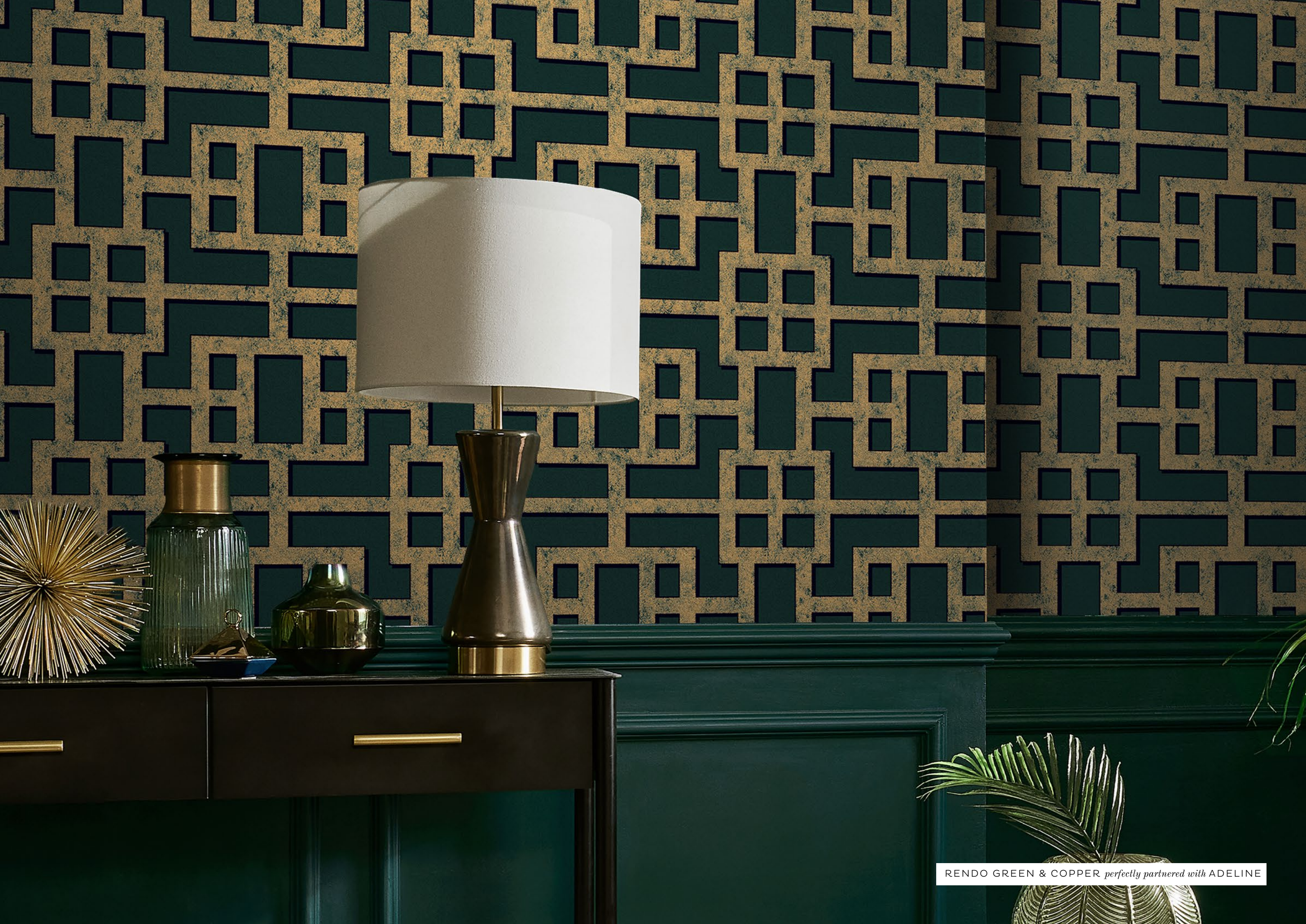
RENDO GREEN & COPPER perfectly partnered with ADELINÉ