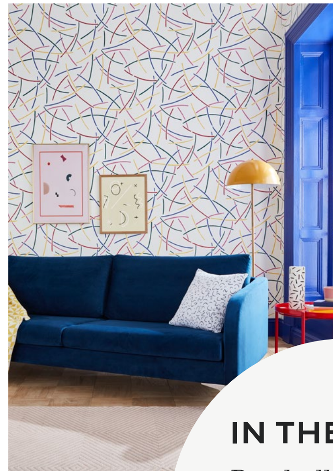
Memphis Mayhem Wallpaper as seen in IDEAT FRANCE