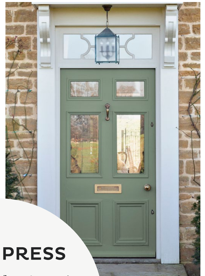
Accrington Road Exterior Eggshell as seen in LIVING ETC