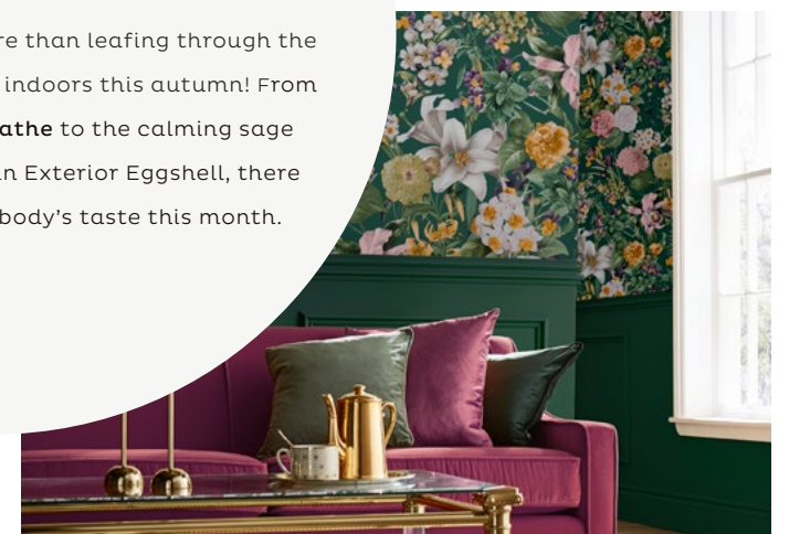
Glasshouse Flora Emerald Wallpaper as seen in REAL HOMES MAGAZINE