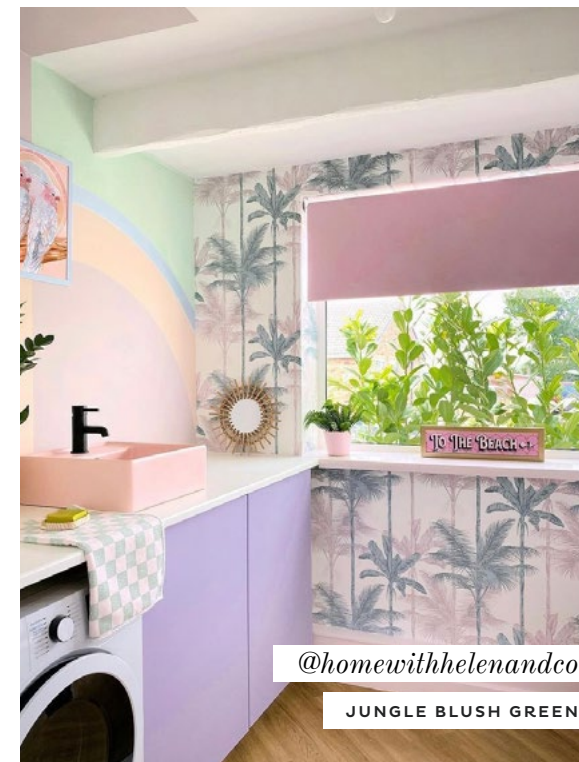
@homewithhelenandco JUNGLE BLUSH GREEN