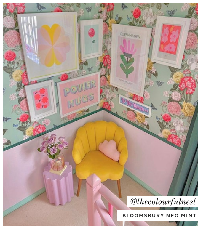
BLOOMSBURY NEO MINT

Tag us, submit a review and become part of the Loving Home family #Grahamandbrown #Lovinghome