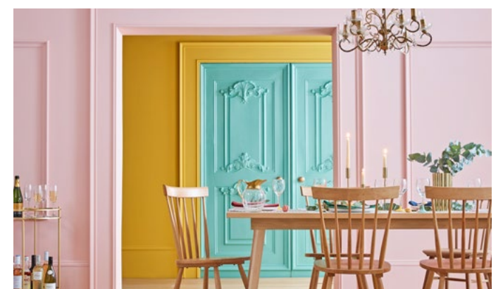
August, Tuscan Sunshine & Potion as seen in THE SUNDAY TIMES