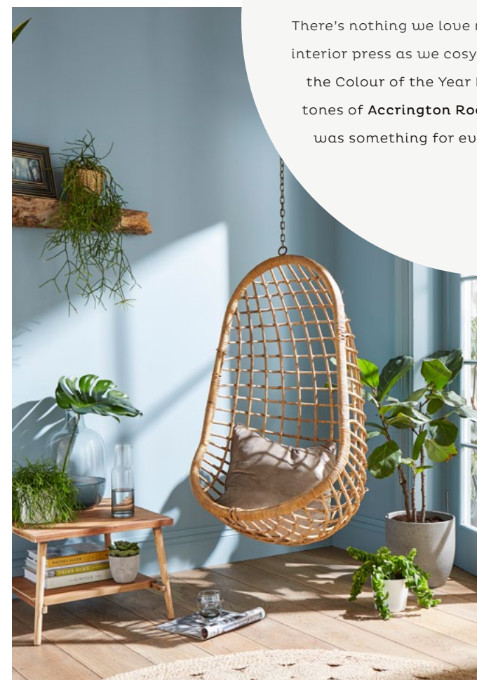
Breathe as seen in HOUSE TIPSTER US

There's nothing we love more than leafing through the interior press as we cosy up indoors this autumn! From the Colour of the Year Breathe to the calming sage tones of Accrington Road in Exterior Eggshell, there was something for everybody's taste this month.