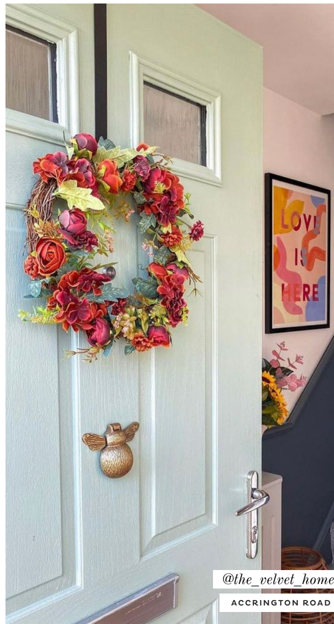
@the_velvet_home ACCRINGTON ROAD