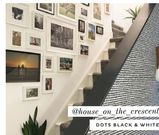
@house_on_the_crescent DOTS BLACK & WHITE