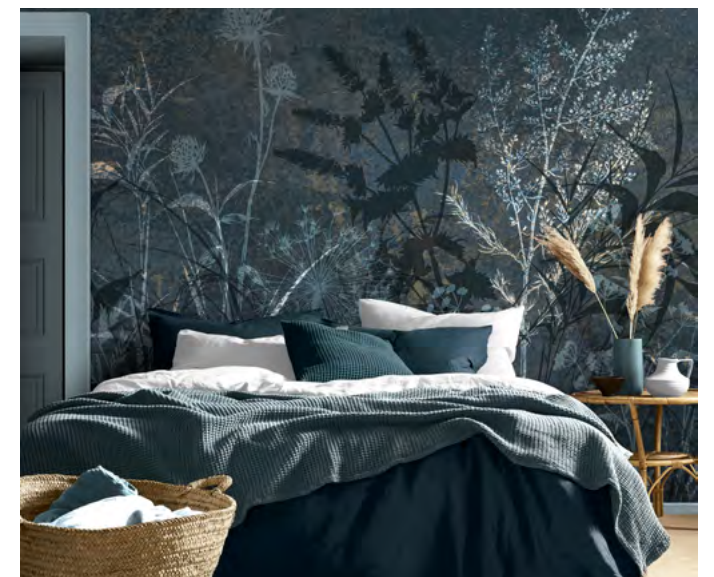
RESTORE MIDNIGHT BESPOKE MURAL HOSPITALITY DESIGN US