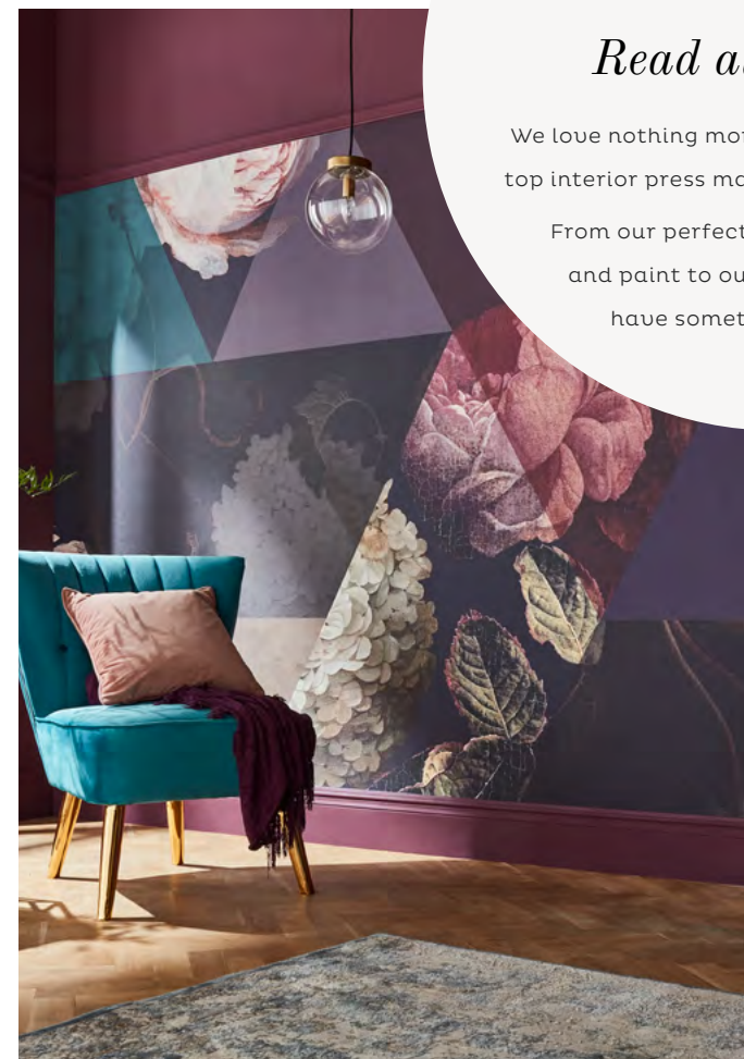
TIMEPIECE AMETHYST MURAL BESPOKE MURAL REAL HOMES