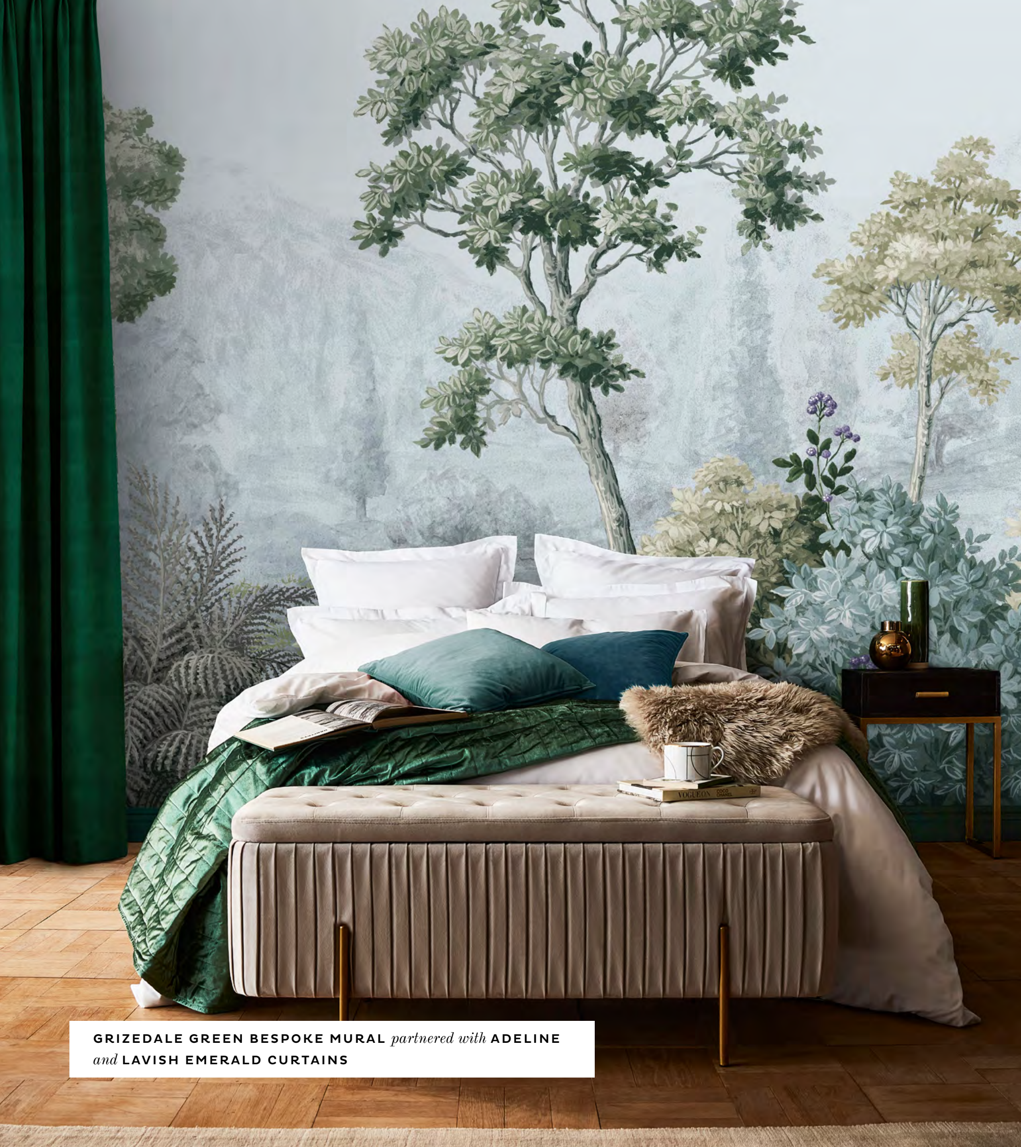
GRIZEDALE GREEN BESPOKE MURAL partnered with ADELINE and LAVISH EMERALD CURTAINS