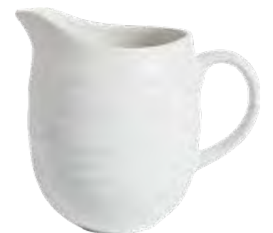
JUG Textured Stoneware johnlewis.com