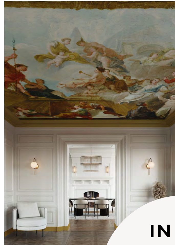
A REPRESENTATION OF THE LIBERAL ARTS BESPOKE MURAL HOMES AND GARDEN