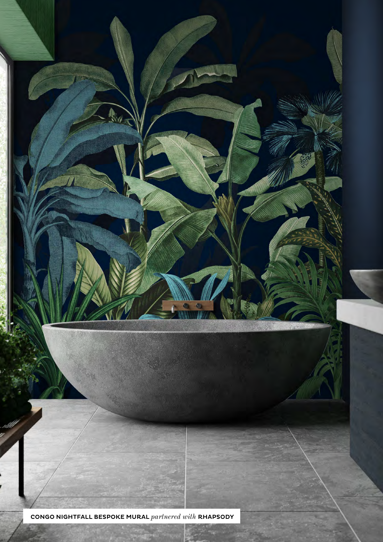
CONGO NIGHTFALL BESPOKE MURAL partnered with RHAPSODY