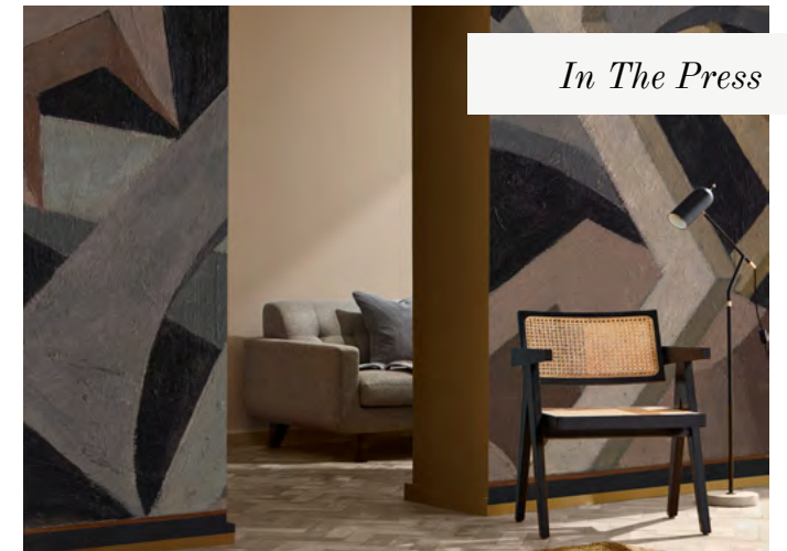
DISMORR ABSTRACT COMPOSITION BESPOKE MURAL LINDA NL