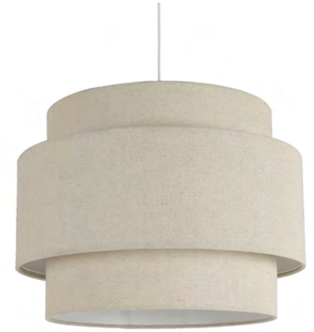
LAMP SHADE Triple Layer marksandspencer.com

The Congo custom wallpaper comes from the Why on Earth trend. The design is subtle and sophisticated, depicting a picturesque jungle scene in deep and earthy hues, bringing a serene sense of calm into any room.