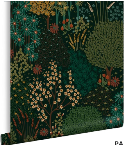
PAPER Fable Forest grahambrown.com

Nothing says cosy like a Cottagecore bedroom or guest room, and the Fable design is also ideal for creating the ultimate cosy corner or reading snug, transporting you into a fantasy world where the problems of our day-to-day lives can melt away.