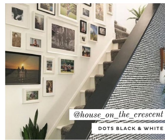
@house_on_the_crescent DOTS BLACK & WHITE