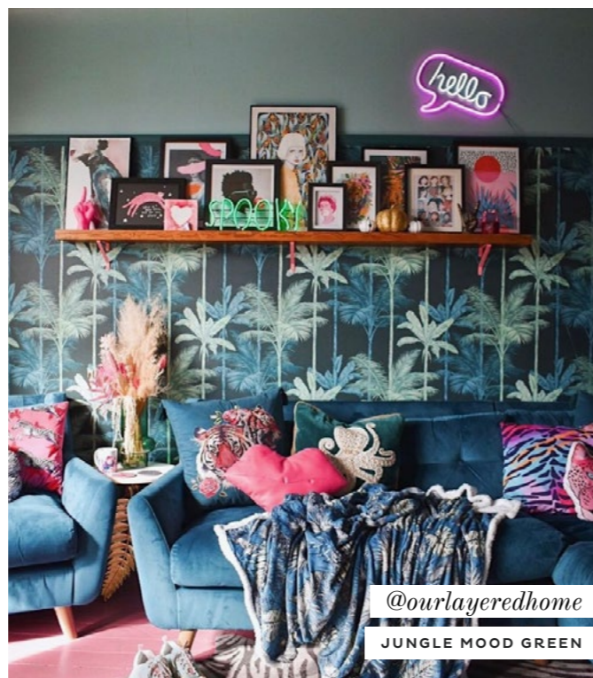
@ourlayeredhome JUNGLE MOOD GREEN