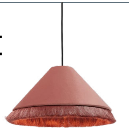
LAMP SHADE Syed Tasselled, Dusty Pink Velvet made.com