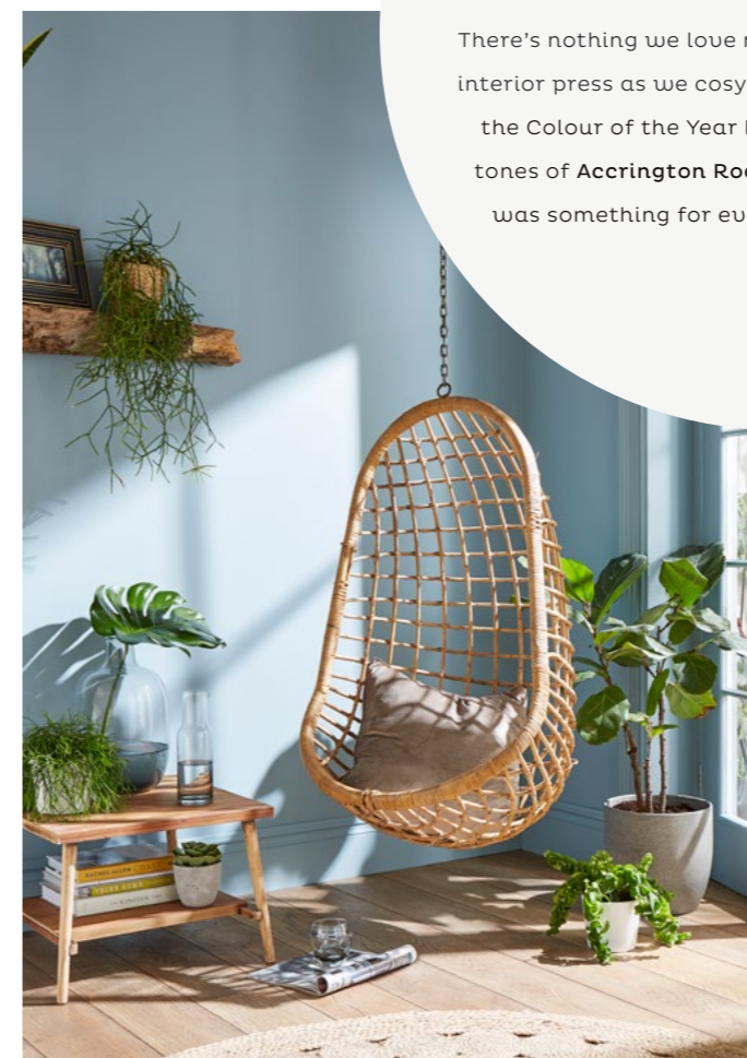
Breathe as seen in HOUSE TIPSTER US

There's nothing we love more than leafing through the interior press as we cosy up indoors this autumn! From the Colour of the Year Breathe to the calming sage tones of Accrington Road in Exterior Eggshell, there was something for everybody's taste this month.