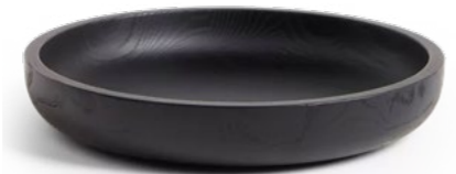
BOWL Ash Wood Low Serving Bowl johnlewis.com