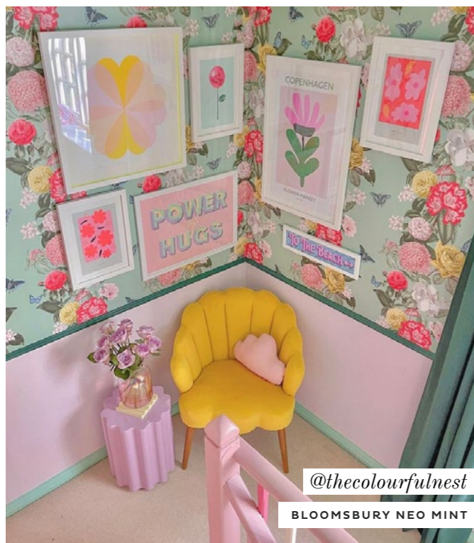
@thecolourfulnest BLOOMSBURY NEO MINT

Tag us, submit a review and become part of the Loving Home family #Grahamandbrown #Lovinghome