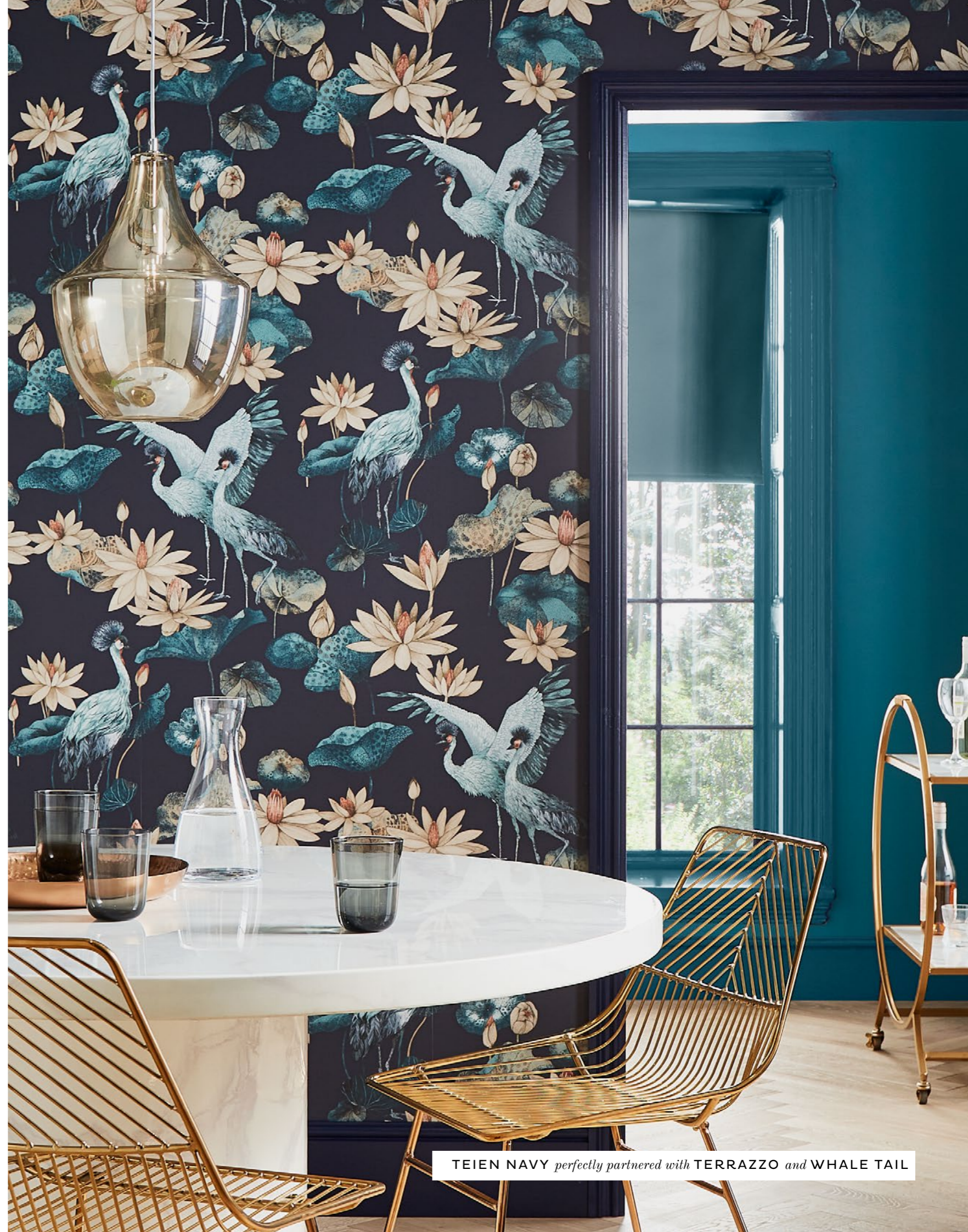
TEIEN NAVY perfectly partnered with TERRAZZO and WHALE TAIL

“Rendo draws on the simplified structures and architectural references with a repetitive pattern that calms the senses and brings order to the chaos where comfort is found in the routine,” adds Paula.