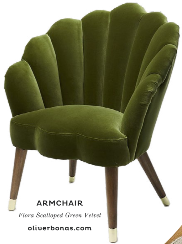
ARMCHAIR Flora Scalloped Green Velvet oliverbonas.com