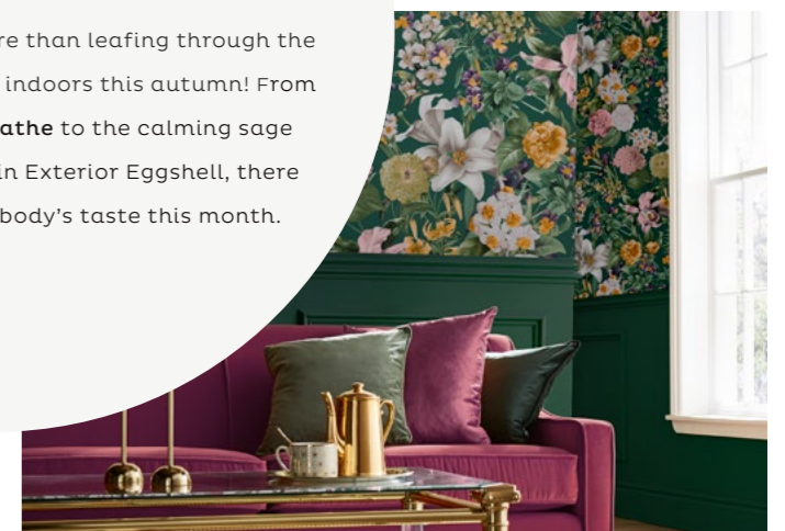
Glasshouse Flora Emerald Wallpaper as seen in REAL HOMES MAGAZINE