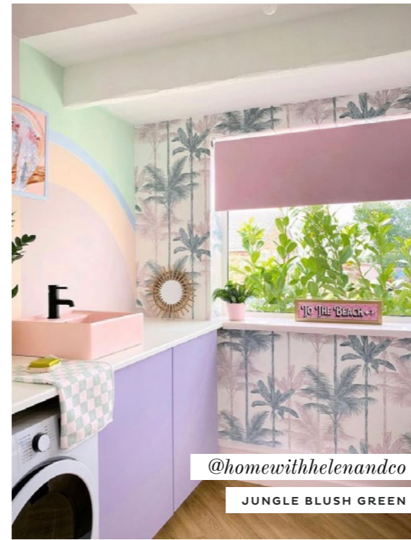
@homewithhelenandco JUNGLE BLUSH GREEN