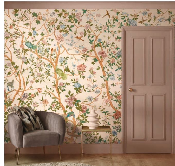
CHINOISERIE NEUTRAL MURAL AND CAPULET PAINT THE TIMES