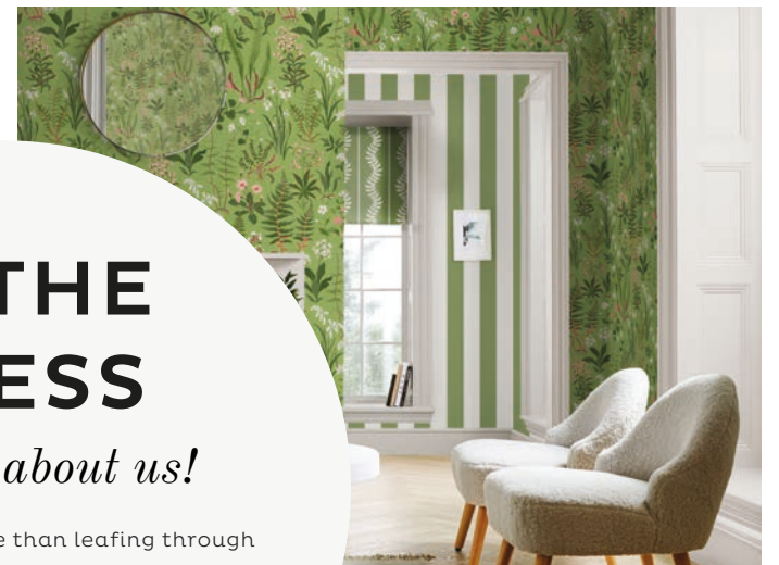
OSHIBANA GREEN WALLPAPER SCOTTISH HOMES & INTERIORS