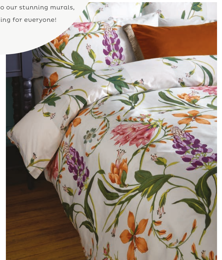
BOTANICAL BRIGHT BED LINEN THE TIMES