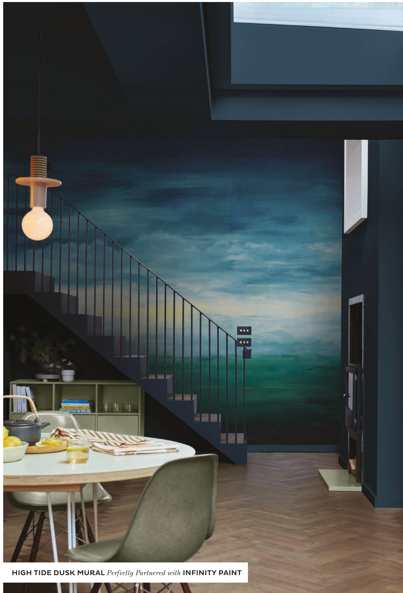
HIGH TIDE DUSK MURAL Perfectly Partnered with INFINITY PAINT