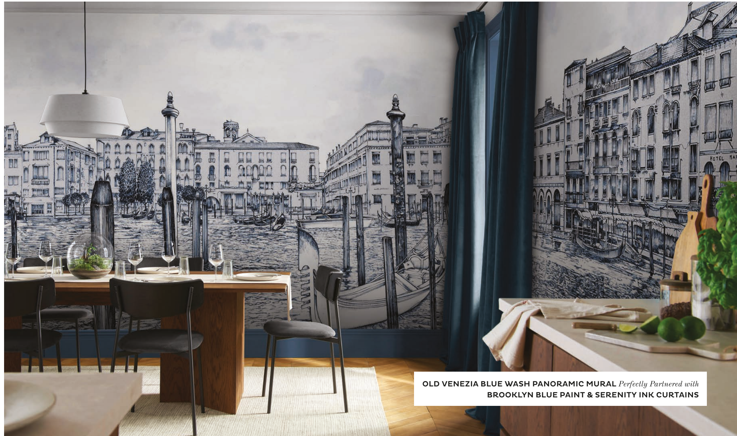
OLD VENEZIA BLUE WASH PANORAMIC MURAL Perfectly Partnered with BROOKLYN BLUE PAINT & SERENITY INK CURTAINS