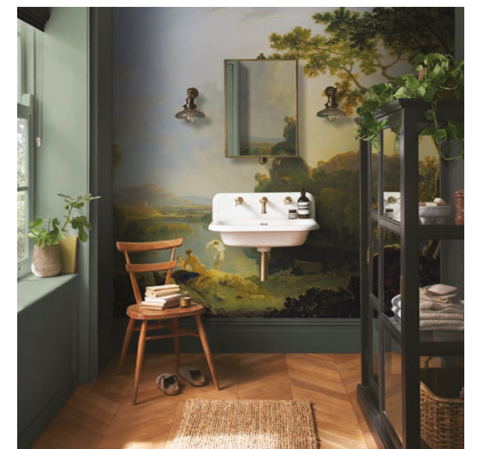
LANDSCAPE WITH BATHERS Perfectly Partnered with ACCRINGTON ROAD PAINT

Exclusively shop the collection at grahambrown.com .