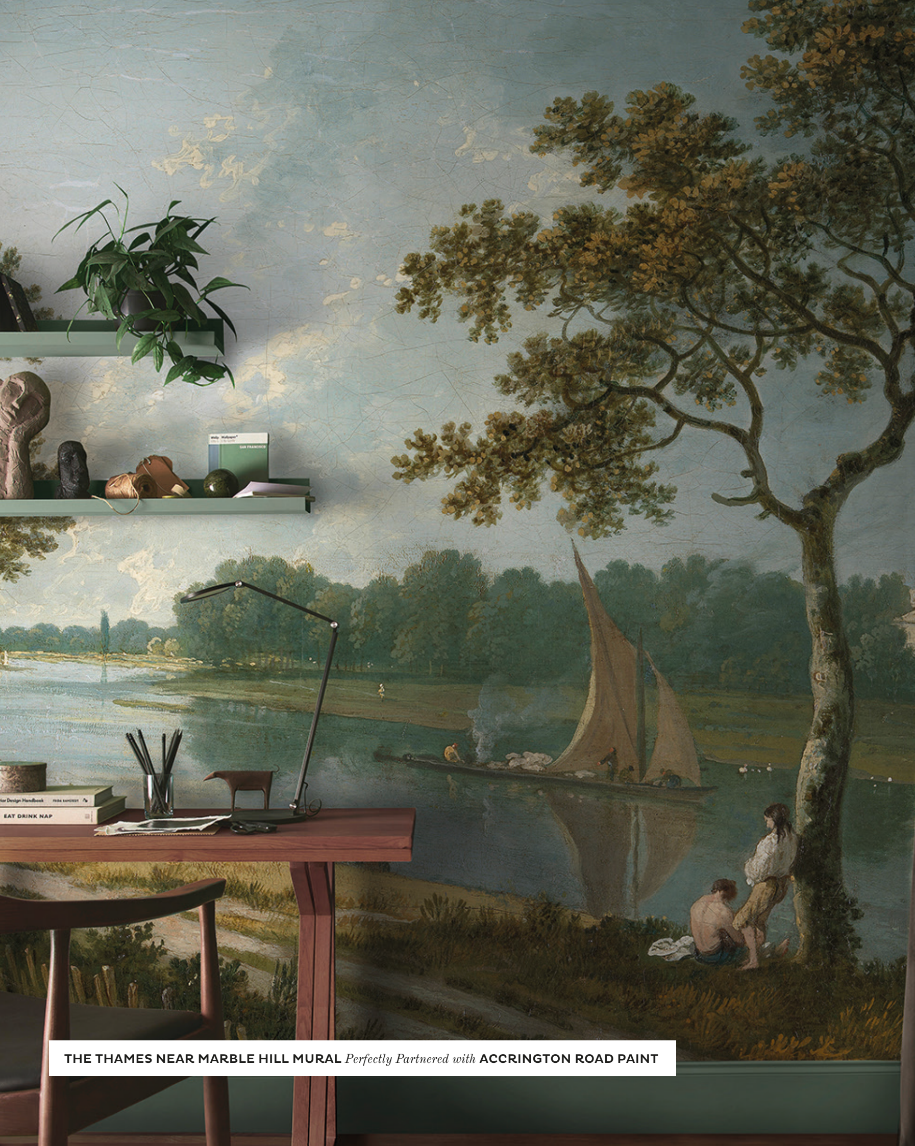
THE THAMES NEAR MARBLE HILL MURAL Perfectly Partnered with ACCRINGTON ROAD PAINT