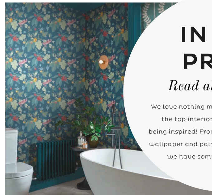
CRAFTWORK TRAIL NAVY WALLPAPER CHESHIRE LIVING