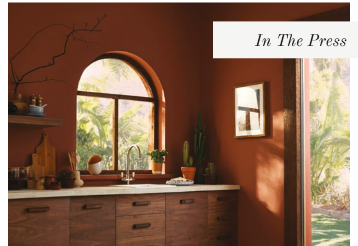
In The Press