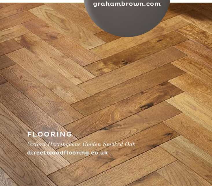
FLOORING Oxford Herringbone Golden Smoked Oak directwoodflooring.co.uk