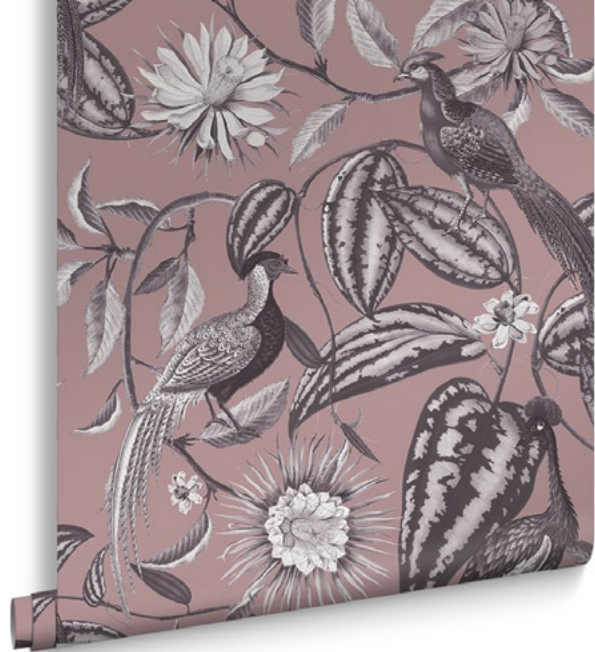
WALLPAPER Amherst's Garden Mulberry grahambrown.com

Amherst's Garden Mulberry wallpaper, perfect for adding warmth to the home. Set in a calming dusky mauve colourway, this floral design is complimented by light and dark shades of grey.