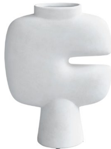
ORNAMENT Tribal Vase Medio nordicnest.com