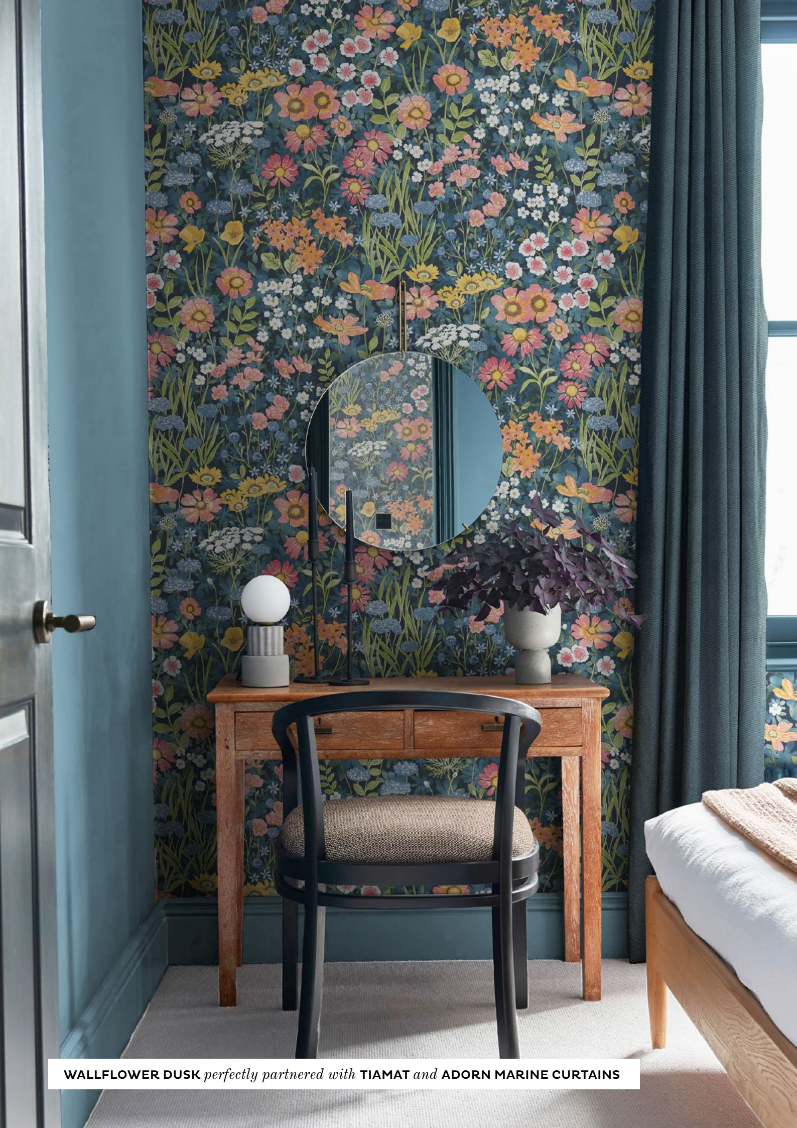
WALLFLOWER DUSK perfectly partnered with TIAMAT and ADORN MARINE CURTAINS