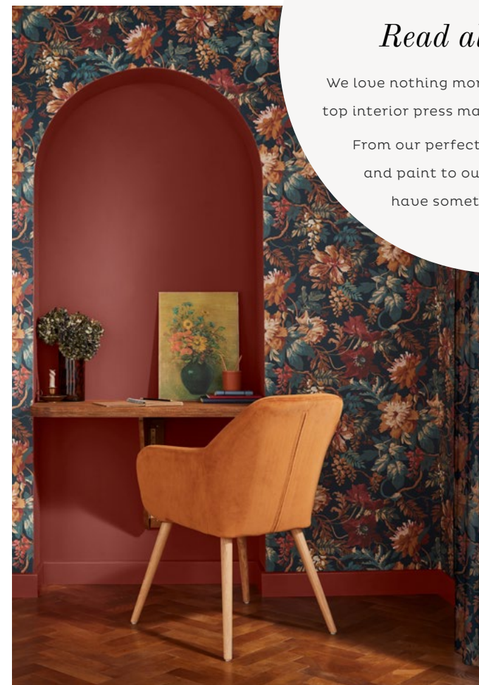
FLORENZIA DUSK WALLPAPER YOUR HOME MAGAZINE