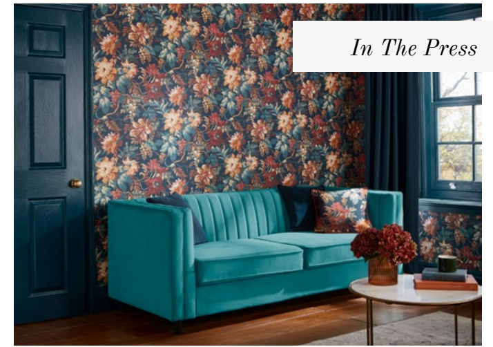
In The Press