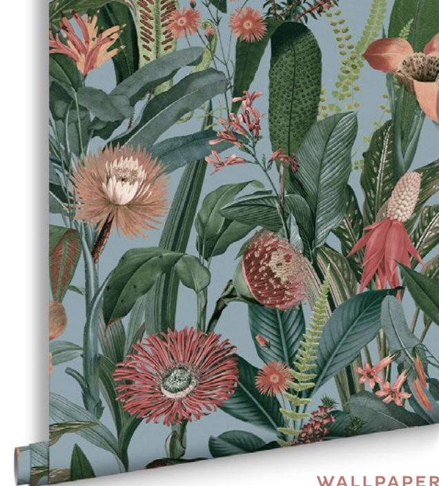
WALLPAPER Tigerlily Sky grahambrown.com

Love the colour but not feeling patterns right now? No problem! Our Wallace Peach curtains and blinds are the perfect tonal counterpart.