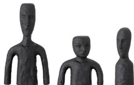
ORNAMENT Rhea Deco Black Metal fab-home.co.uk