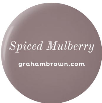
PAINT Pisa & Spiced Mulberry grahambrown.com