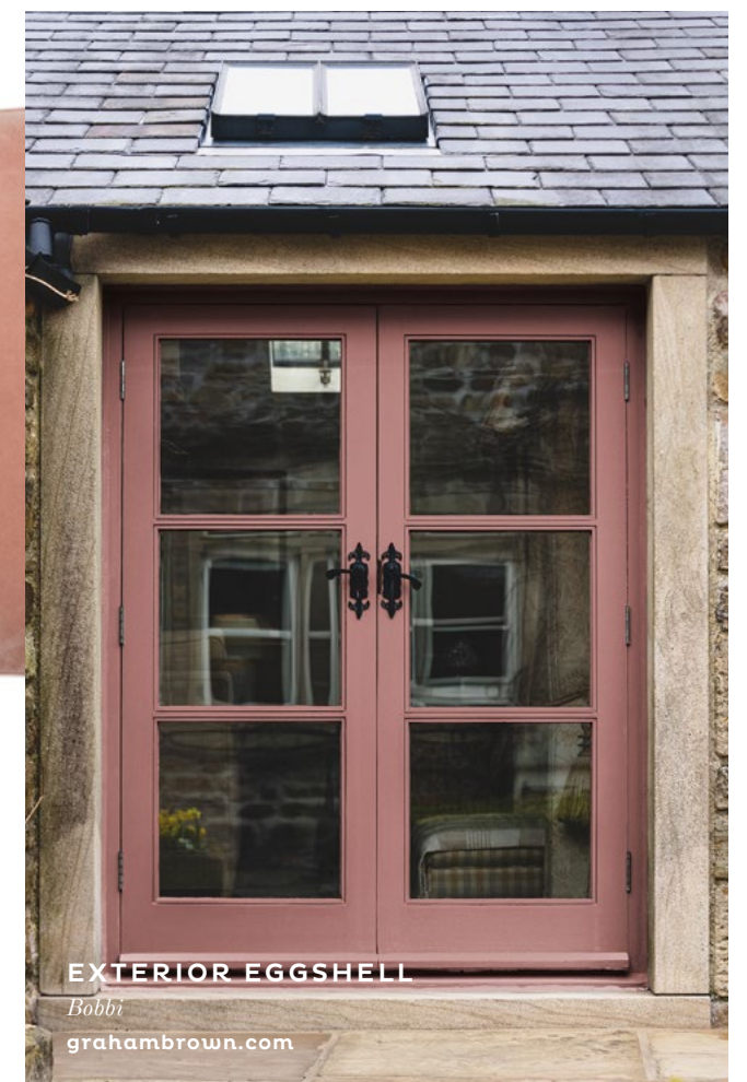
EXTERIOR EGGSHELL Bobbi grahambrown.com