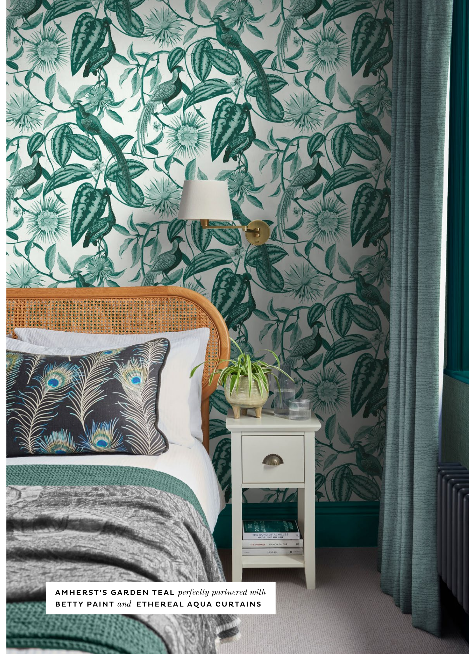
AMHERST'S GARDEN TEAL perfectly partnered with BETTY PAINT and ETHEREAL AQUA CURTAINS