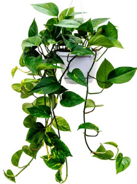
PLANT Epipremnum Aureum - Golden Pothos horticulture.com