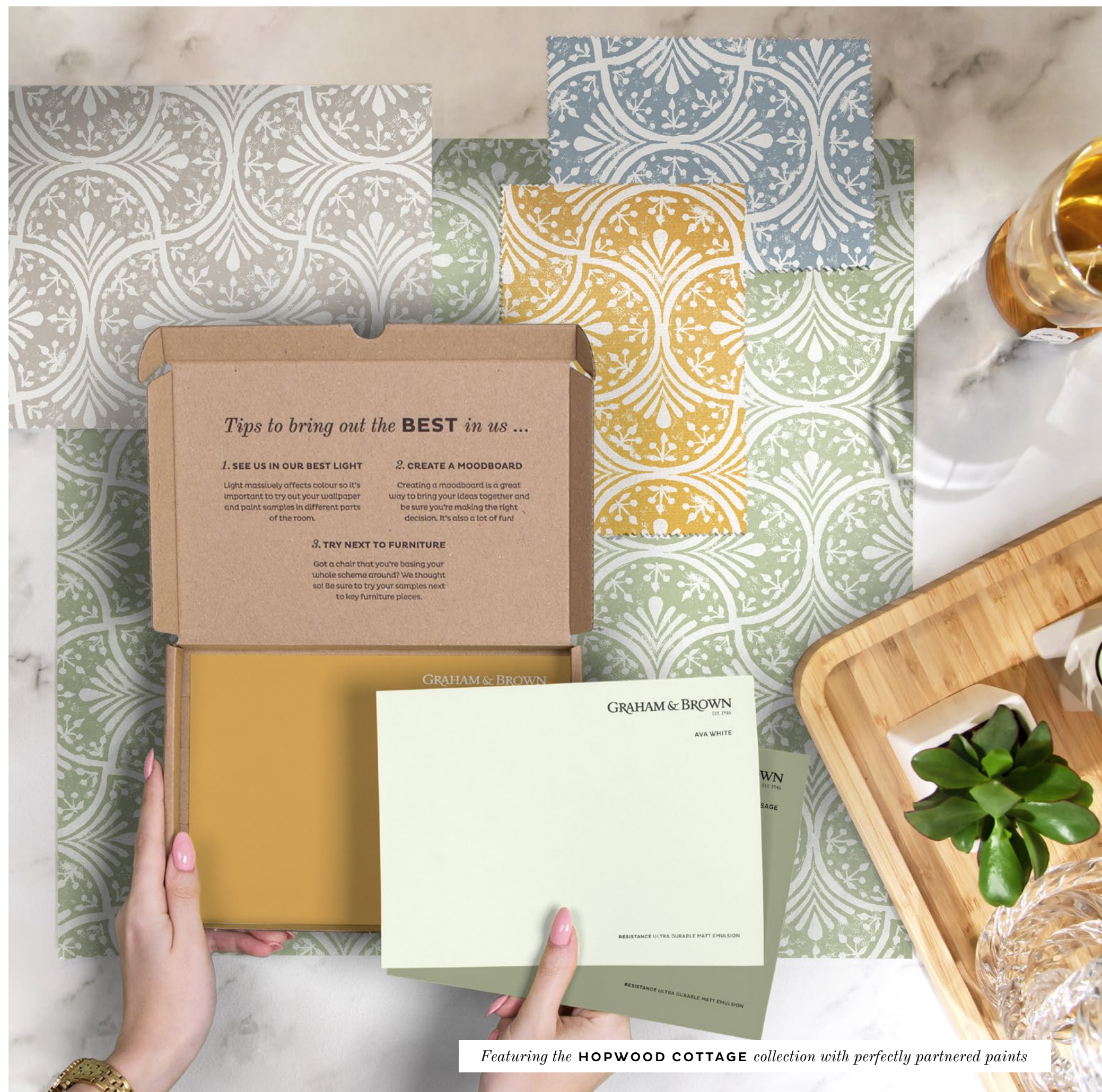
Featuring the HOPWOOD COTTAGE collection with perfectly partnered paints