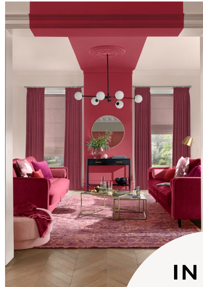
VIXEN PAINT HOUSE AND LIFESTYLE MAGAZINE