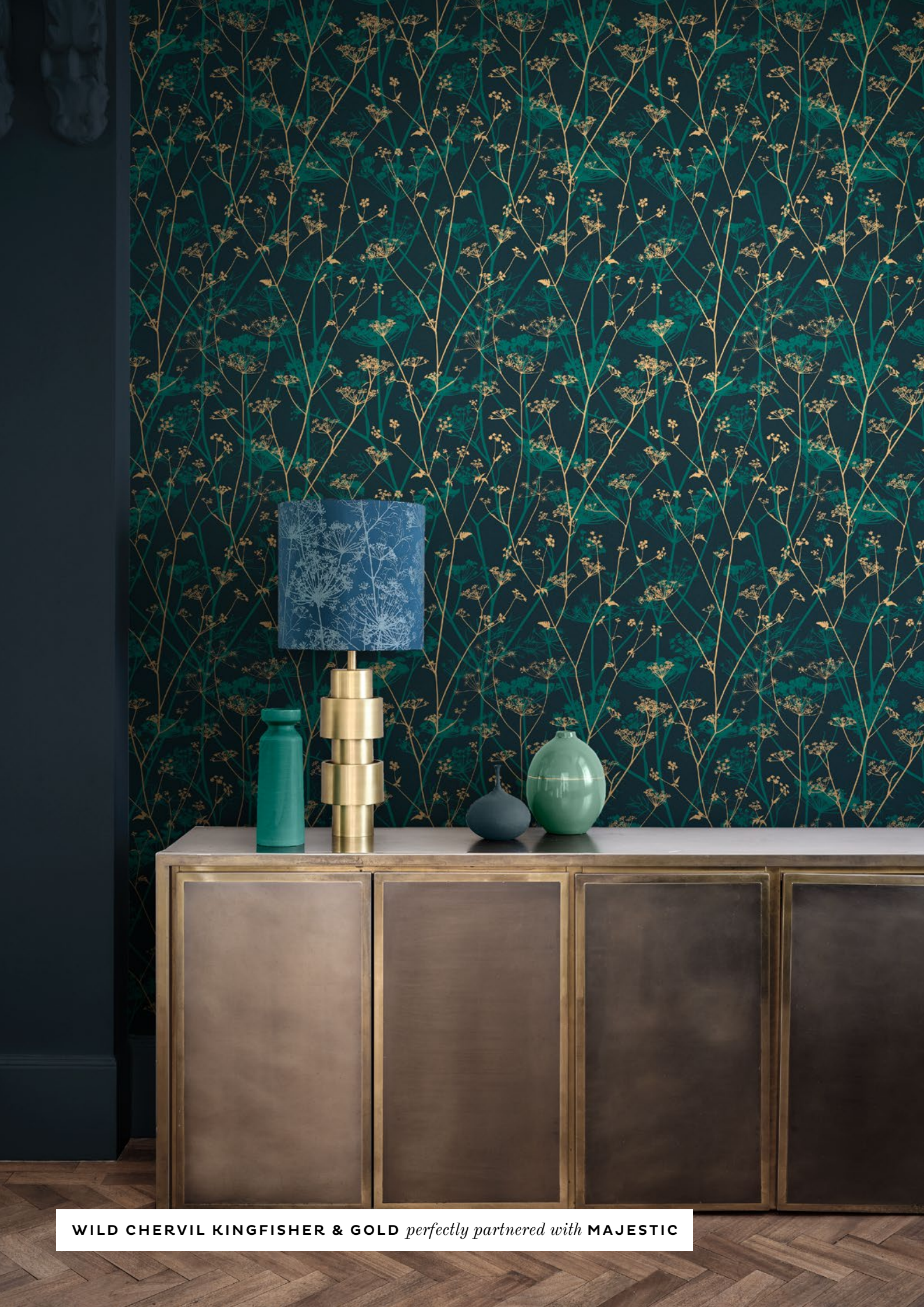
WILD CHERVIL KINGFISHER & GOLD perfectly partnered with MAJESTIC