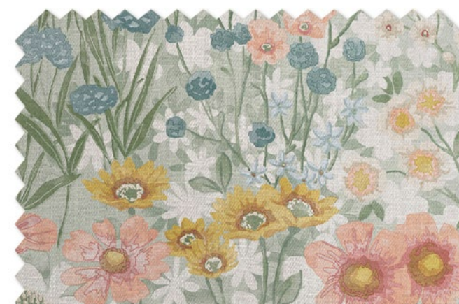
FABRIC Wallflower Day grahambrown.com