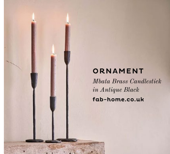
ORNAMENT Mbala Brass Candlestick in Antique Black fab-home.co.uk

Amherst's Garden Mulberry wallpaper, perfect for adding warmth to the home. Set in a calming dusky mauve colourway, this floral design is complimented by light and dark shades of grey.