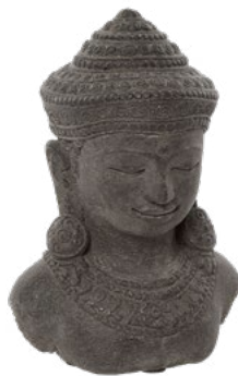
ORNAMENT Buddha Head tkmaxx.com