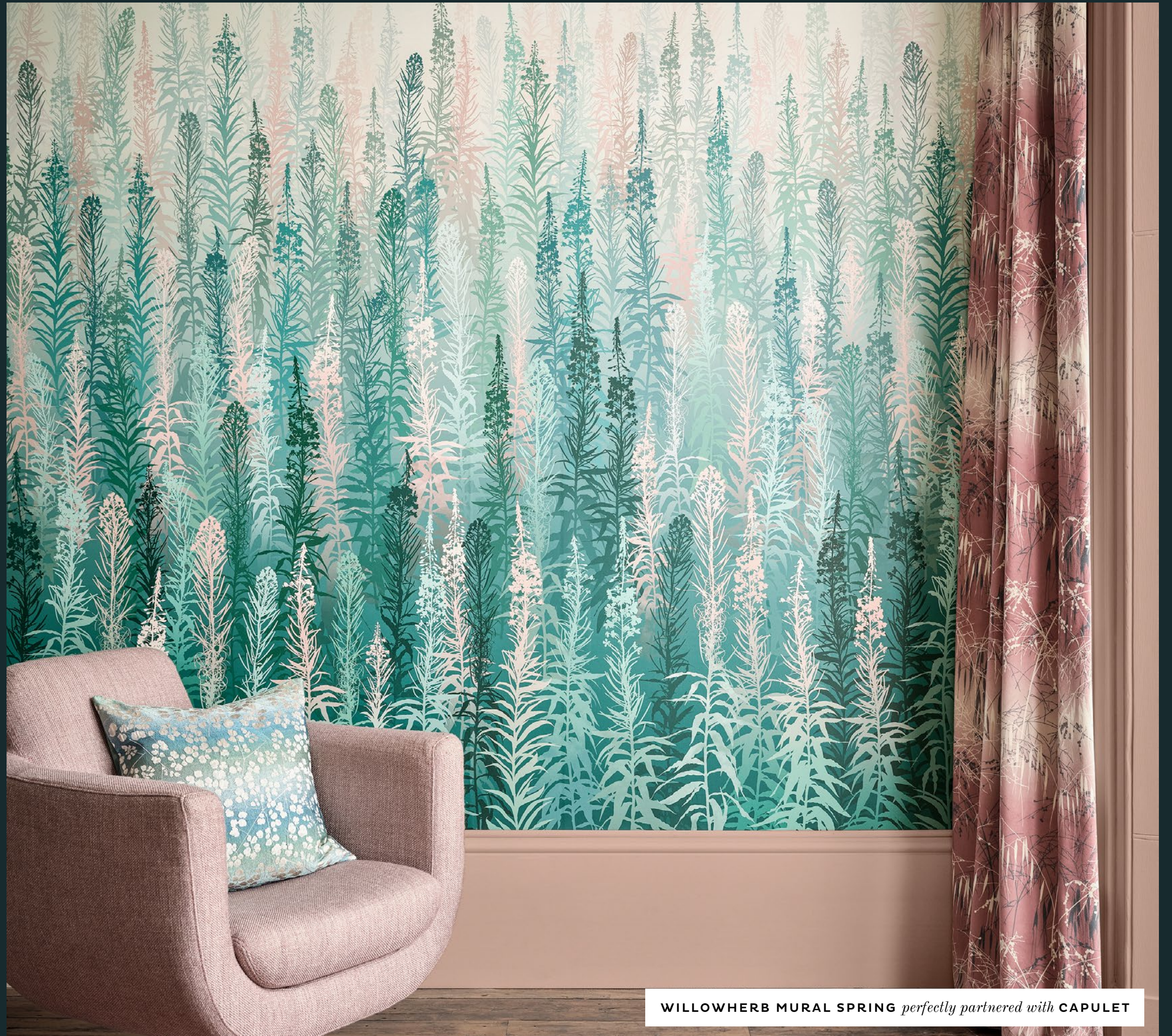
WILLOWHERB MURAL SPRING perfectly partnered with CAPULET