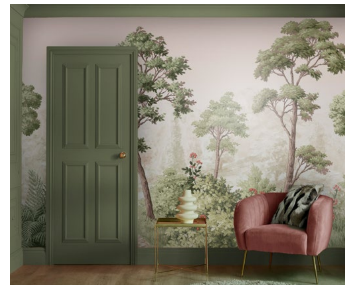
GRIZEDALE GREEN BESPOKE MURAL THE TIMES (UK)