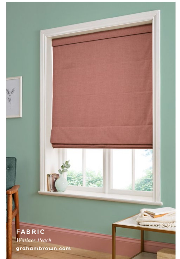
FABRIC Wallace Peach grahambrown.com