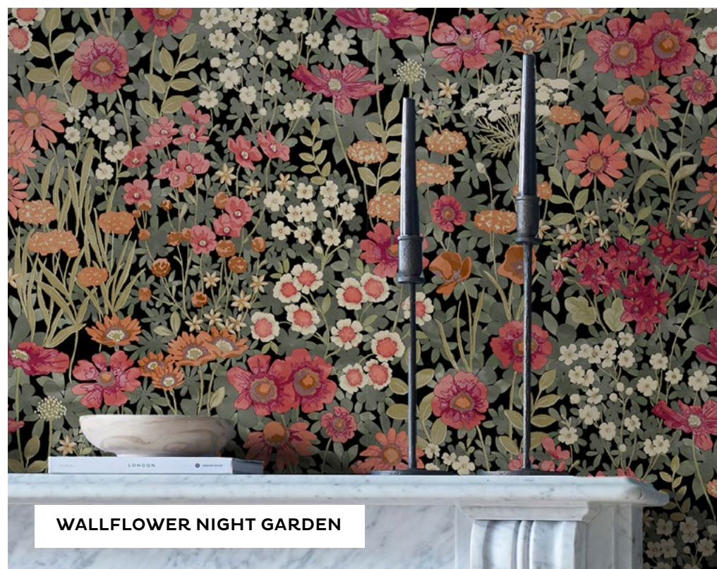
WALLFLOWER NIGHT GARDEN

The Wallflower collection is the perfect design to welcome spring in, with palettes reminiscent of each stage of the day. The Day colourway features softer tones on a sage backdrop that's perfect for the early rising optimist, while the Night Garden colourway boasts pops of colour against black for maximum night-time escapism. Style your choice with perfectly partnered window dressings and paints.